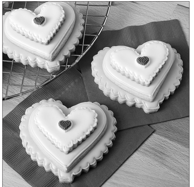
Stackable Ombre Heart Cookies