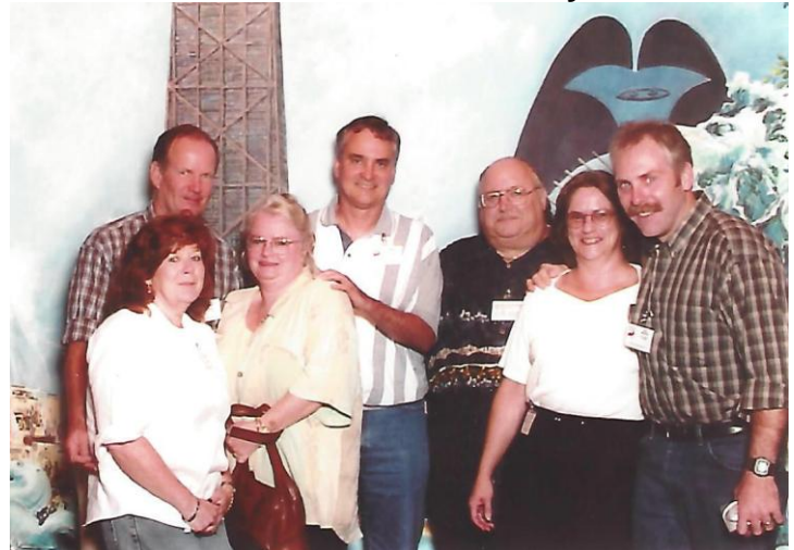
A picture from yesteryear

2nd-Int'l Beer Day 3rd - National Watermelon Day 10-National S'mores day 4th-U.S. Coast Guard Day (one for you Steve) 21 Senior Citizen's Day