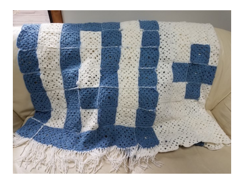
Blankets for the Red Cross by Pam Quarstien