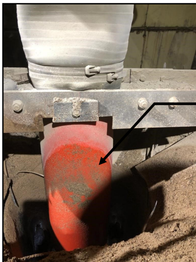
Dry Batch Plant Cement Pipe Cover