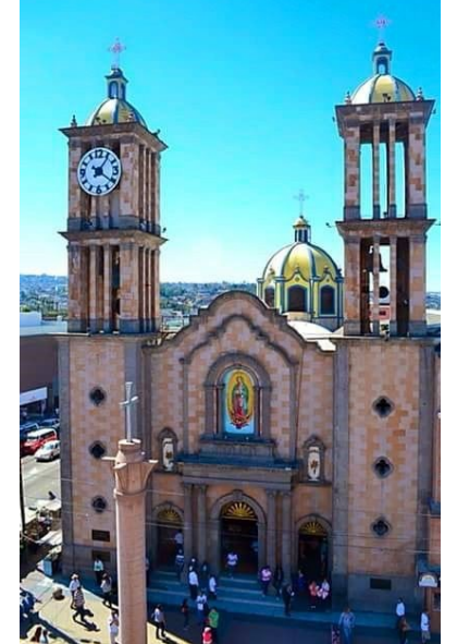
Our Lady of Guadalupe established January 20, 1874. Construction began in 1909 and was completed in 1956 in Tijuana.