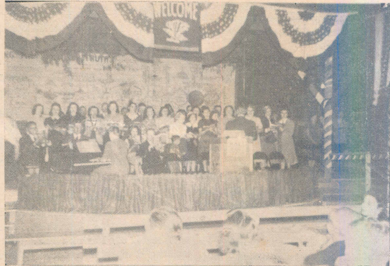
A PART OF THE CHOIR