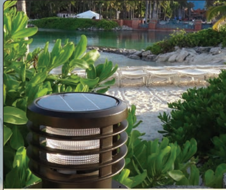
The WLB bollard provides a wide angle of light for area illumination. It is simply and quickly installed with our proven ground anchors.