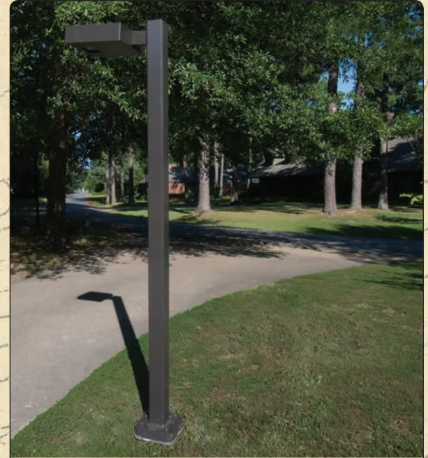
Solar lighting installed with a ground screw foundation is the ideal solution for retro-fit installations. There is no yard excavation for wiring or foundation, no waiting for concrete to cure and minimal clean-up with lower cost. All of which make for happy customers.