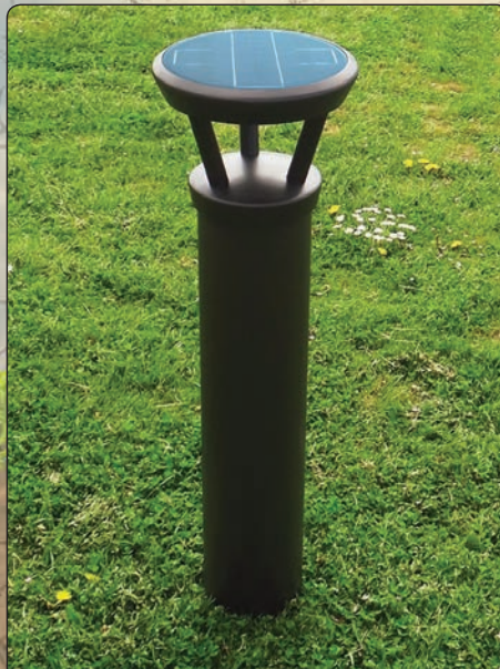
The PLB bollard points light downward to illuminate pathways, sidewalks, trails, ramps, and anywhere else dependable easy-to-install lighting is needed.