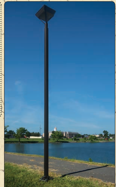
This solar-ground screw foundation setup in a public park took only 30 minutes with no environmental disturbance.

Call us and find out more about our turn-key installation services. Our crews will install your lights or ours with ground anchors. You have no investment in training or equipment.