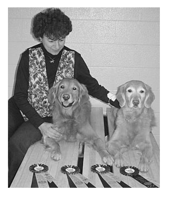
"Sera & Mia" MOTCH Goldencol Moonlight Seranade, JH, WC – Am. CDX MOTCH Heron Acres Sand By Me, RE, WC – Am. UD Sera finished her OTCHX and MOTCH in Belleville Mar.08 Mia finished her RE at the Belleville trial with 2-100's Mar.08