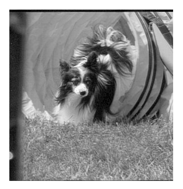
"Bandit" MOTCH Donant's Bandit At Luvits Am CDX AADC Earned his AADC Advanced Agility Dog