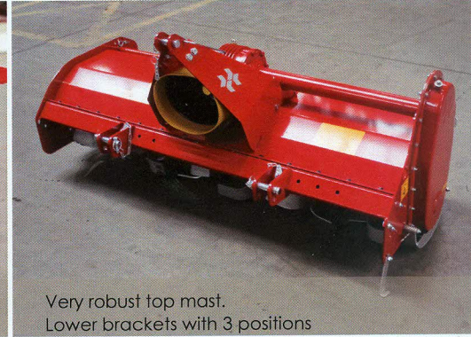
Very robust top mast. Lower brackets with 3 positions

The new range of R310 / R320 Rotavators is a perfect match for all types of compact and specialist tractors up to 45 HP. The robust design integrates all guards, avoiding extra parts. Due to the very smooth flow of soil inside the machine, the end result is an effective tillage. The special design of the frame and trailing board helps to give a perfect finish, with a highly effective crumbling and leveling effect.