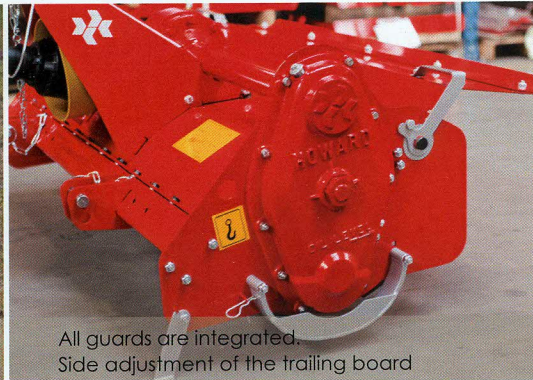
All guards are integrated. Side adjustment of the trailing board