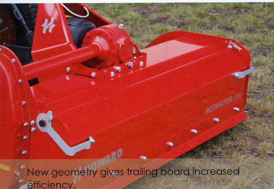
New geometry gives trailing board increased efficiency.