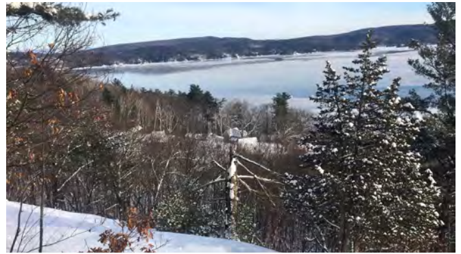
Lake beginning to freeze over in mid-January.

Day and again for Americade. They also authorized an agreement with the Town of Chester for use of the Chester Animal Shelter. In addition, they authorized a contract with Cedarwood Engineering for 2019 and an agreement with Warren County for an additional $15,000 in occupancy tax funding. ▣