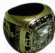
THE WORKS $195