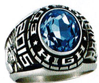
STERLING SILVER $60