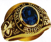
GOLD PLATED $80