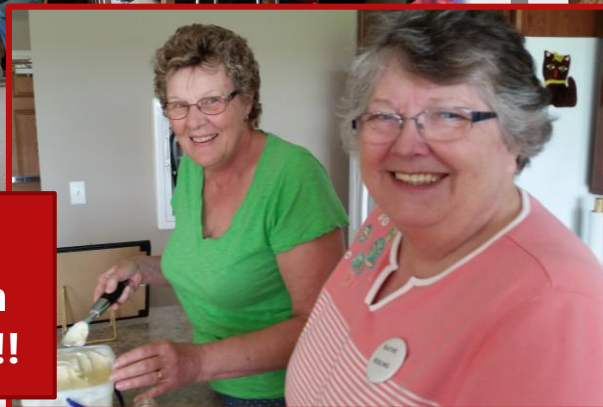
Above & Right: Comfort Care Ice Cream Social at the Village Coop in Cedar Falls! What a crowd we had!!!