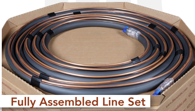
Fully Assembled Line Set