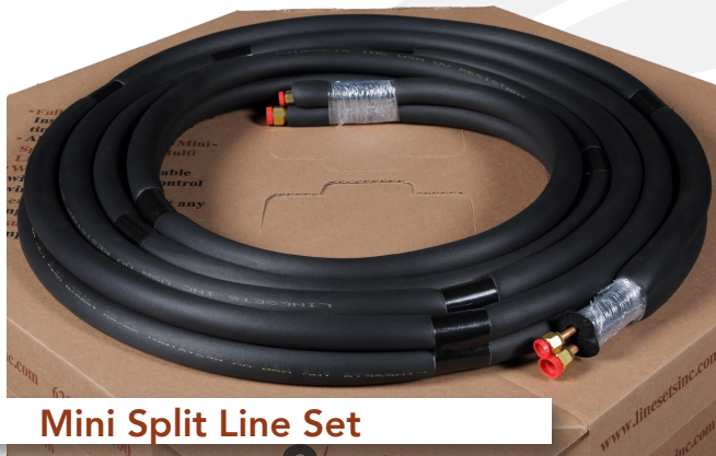
Mini Split Line Set