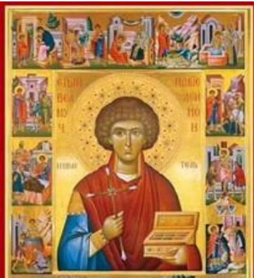
Gr. Martyr and Healer St. Panteleimon