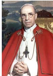
Pope Pius XII Divino Afflante Spiritu 1943