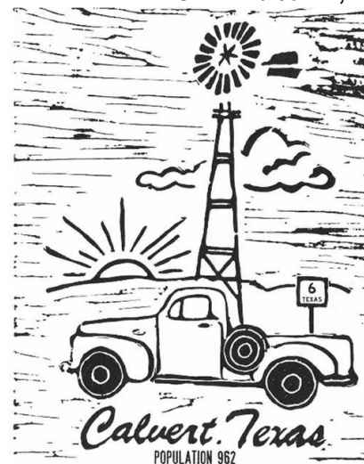
2024 T-SHIRT DESIGN BY SEAN STARR, STARR STUDIOS

UNTIL 10:30 AM; REGISTRATION TABLE AT MAIN & BURNETT INTERSECTION