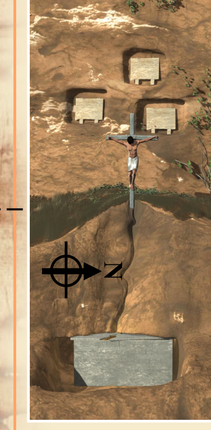
Ark of Covenant