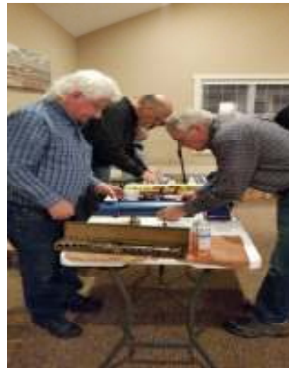
TECH AND TUNE