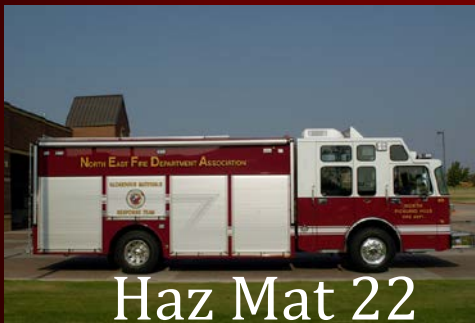
Haz Mat 22