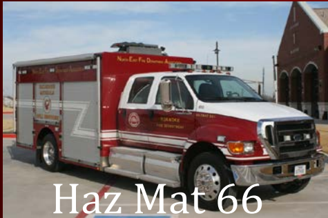
Haz Mat 66