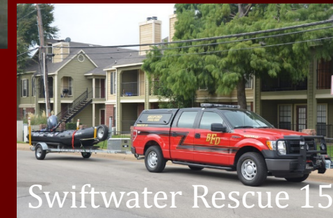
Swiftwater Rescue 15