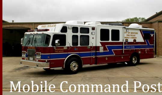
Mobile Command Post