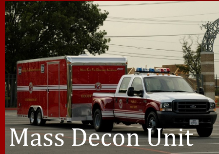
Mass Decon Unit