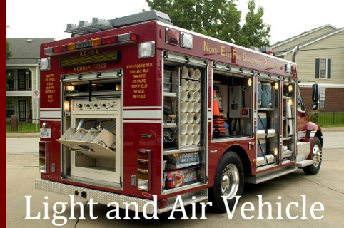
Light and Air Vehicle