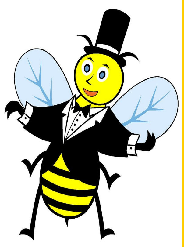
In support of the Carteret Literacy Council

Friday, February 19, 2021 The History Place Doors open at 6:00 PM