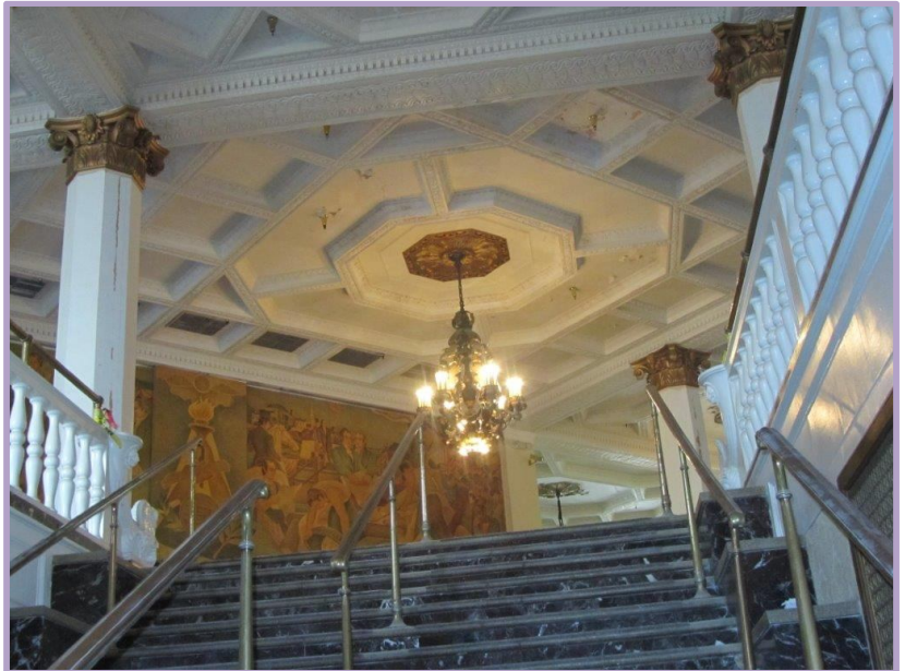
The Hotel Syracuse lobby will maintain its majestic aura and splendor.