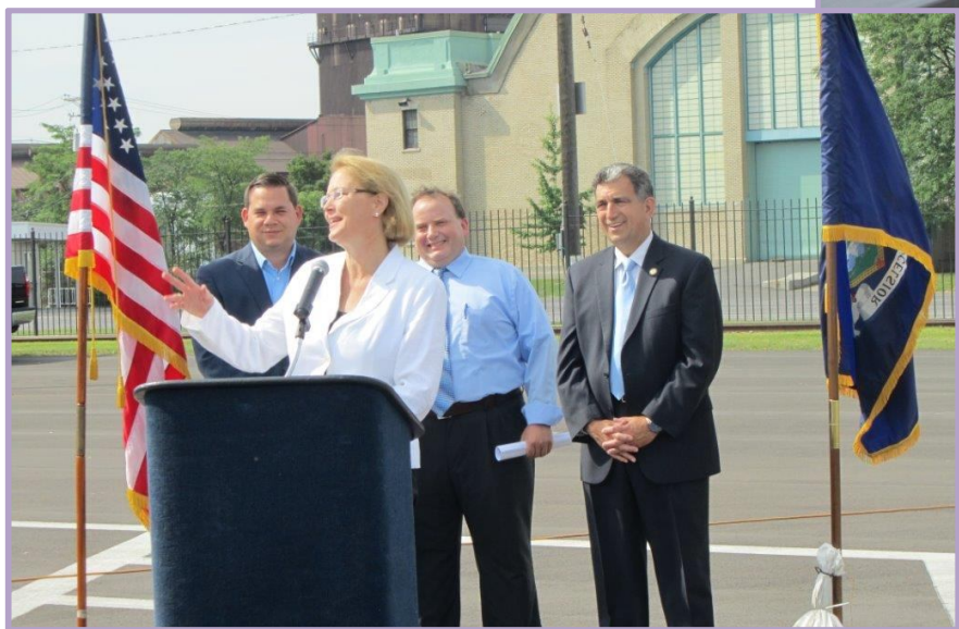
Onondaga County Joanie Mahoney announcing that a major act has been booked for the Onondaga Lake Amphitheater. The County Executive also thanked Assemblyman Magnarelli for passing legislation that allowed the new amphitheater to be built using the "design-build" process. Utilizing the "design-build" process streamlined the design process, shortened construction time, and created additional budget efficiencies.