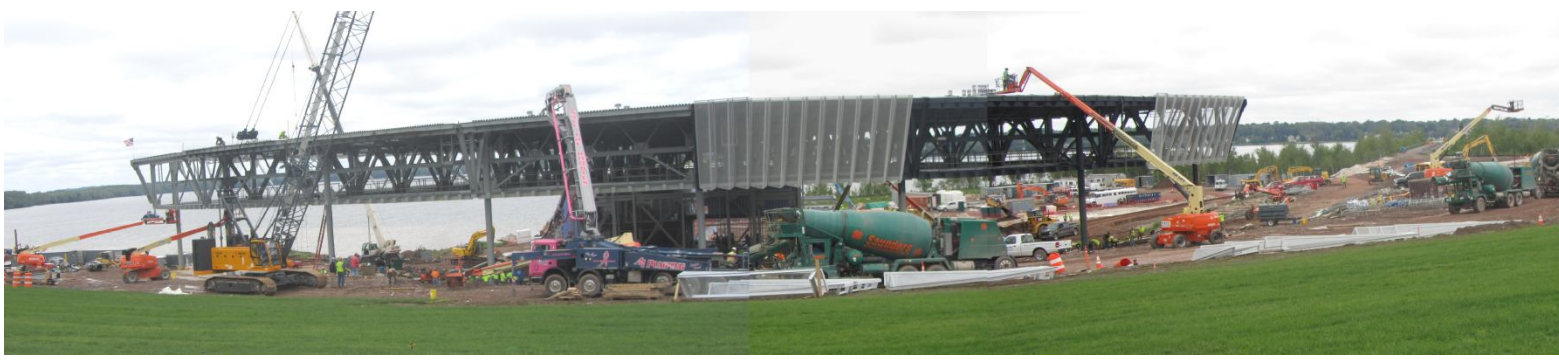
Photo taken in early July shows Amphitheater construction underway. Construction workforce totaling 200+ workers, working 2 shifts daily.