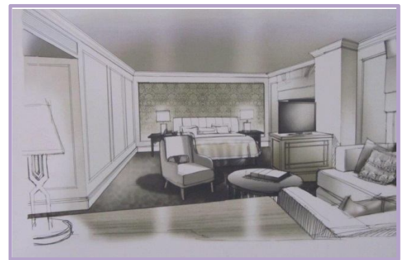
An artist's sketch of the guests rooms for the soon-to-be renovated Hotel Syracuse. The rooms feature expanded floor plans and thoroughly updated and spacious bathrooms.

Assemblyman Magnarelli feels strongly that state funds invested in the renovation of the Hotel Syracuse under the direction of Ed Riley will provide CNY with numerous economic benefits.