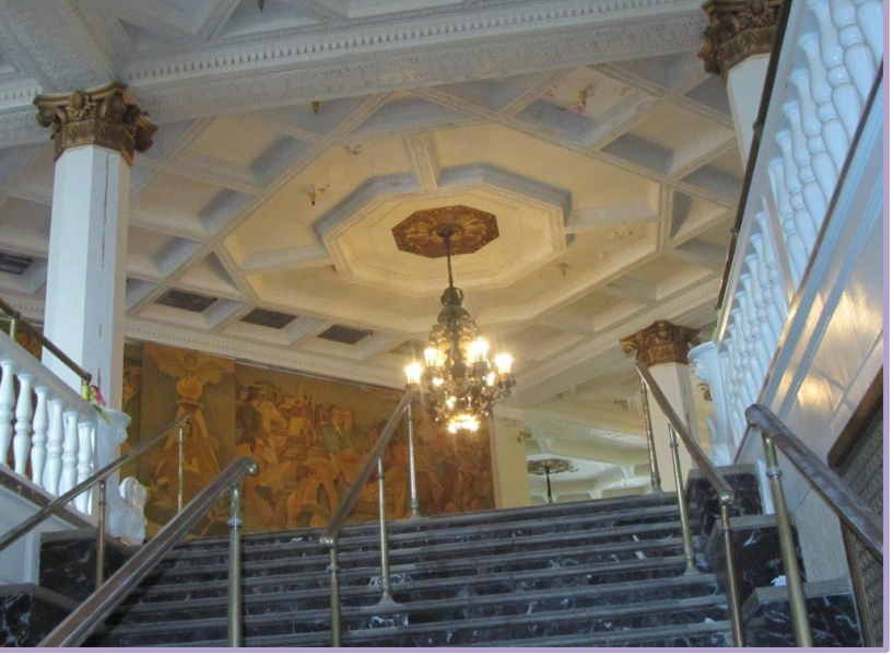
The Hotel Syracuse lobby will maintain its majestic aura and splendor.