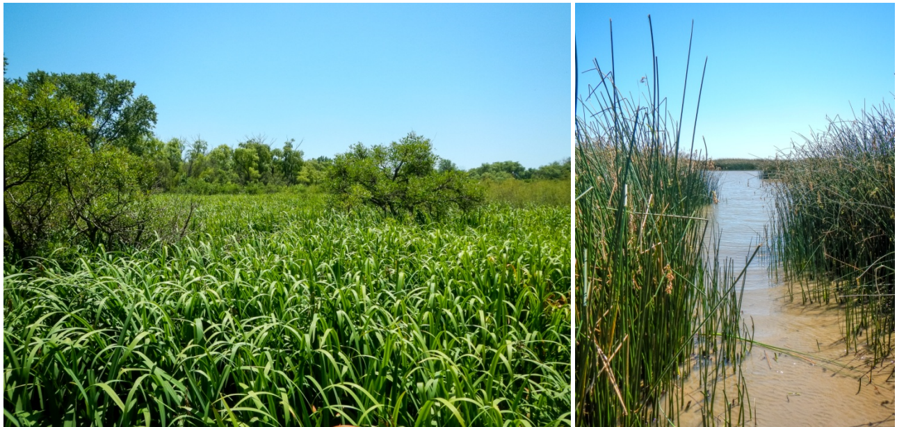
Vegetation along the banks of the Río de la Plata [Ribera Norte, ~20km north of Buenos Aires]