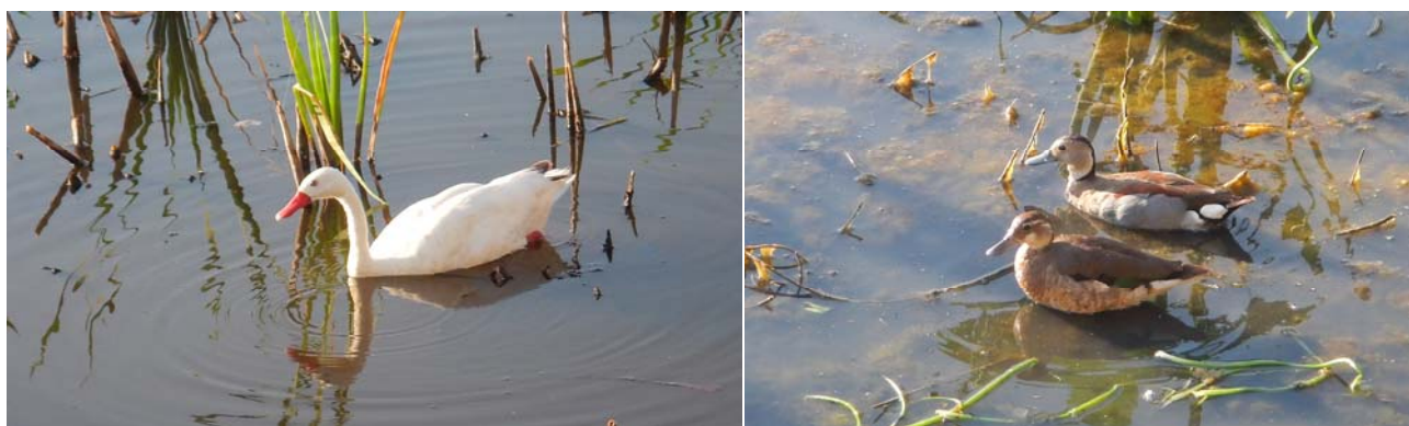
Coscoroba Swan; Ringed Teal [both Costanera Sur]