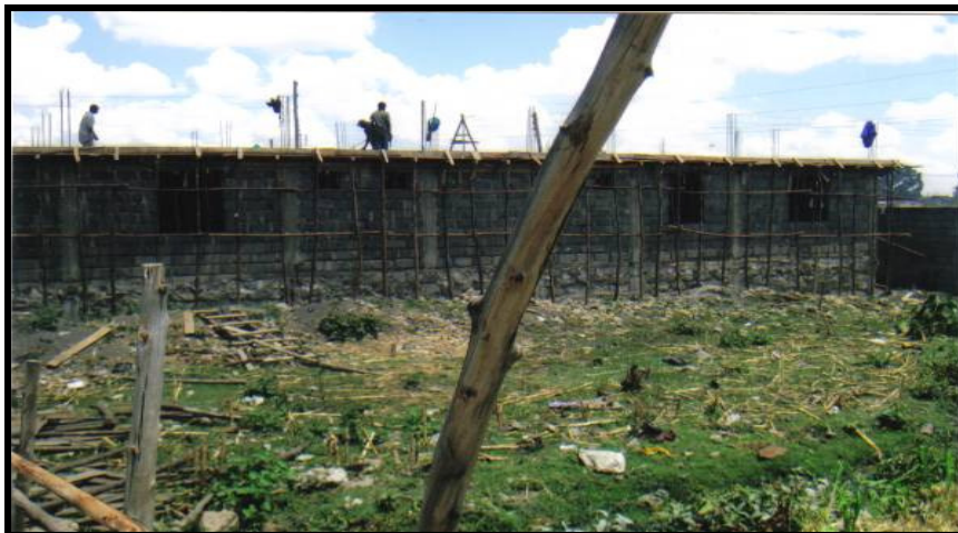
First floor of the new MCDC medical clinic under construction at the Dondora campus (MCDC).

This is where 3 cows (milked every day), 3 calves and 4 pigs are housed. Animal waste will be used for bio-fuel in the kitchen.