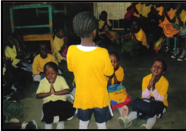
MCDC Kindergarten kids praying in class. Jesus truly is Lord at MCDC!