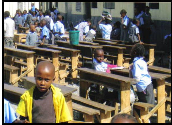
Every Friday afternoon all classrooms are emptied and cleaned by the kids. This would probably be child abuse in the U.S.