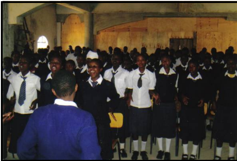
I had the privilege to speak to the several hundred high school kids at MCDC. I encouraged and challenged them to say “yes” to Jesus and “no” to the world, the flesh and the devil.