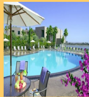
The Dana Inn

1710 W Mission Bay Dr, San Diego, CA 92109 Located 2 minutes away from the Conference Center Visit them at www.thedana.com for accommodations Phone: 619.222.6440