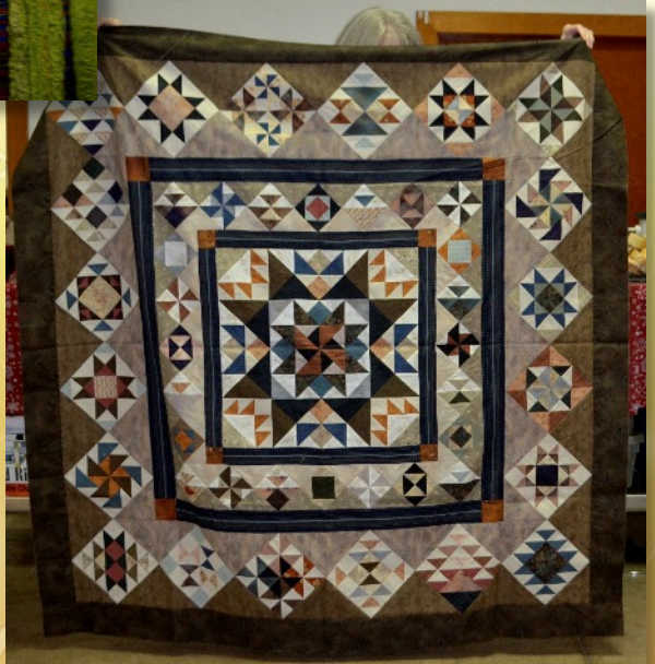
Who's hiding behind this gorgeous creation???