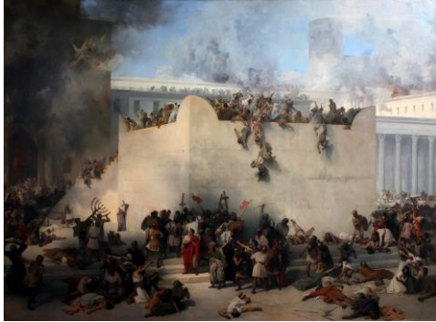
Tisha B'Av – The destruction of the Temple