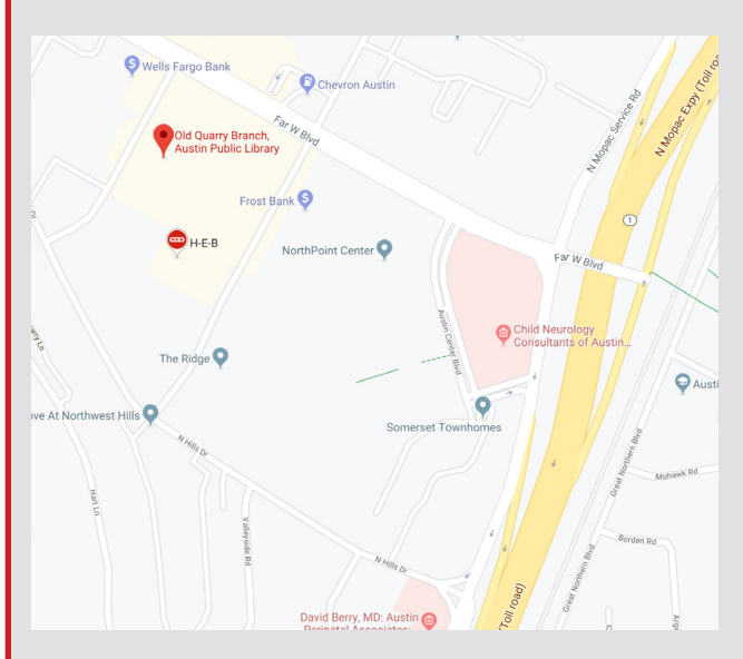
Click map for directions

Let us know if you have any questions and hope to see you there!!