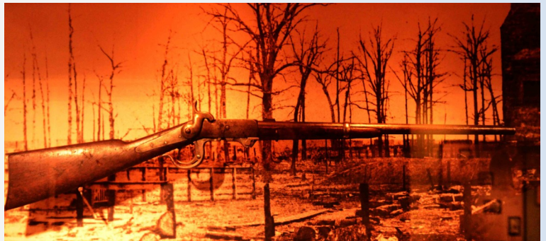
Burnside Rifle Manassas