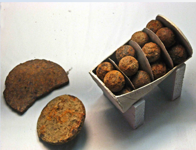
Canister Shot 273 Prairie Grove