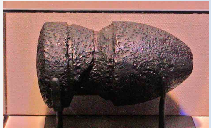
Hotchkiss Shell Stones River