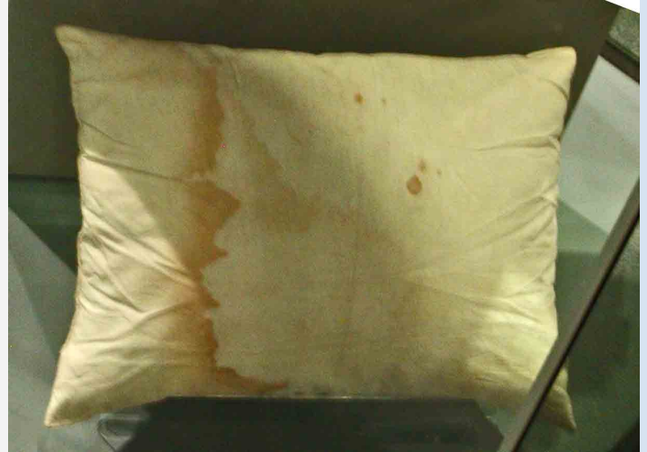
Lincoln blood stained pillow Ford's Theatre