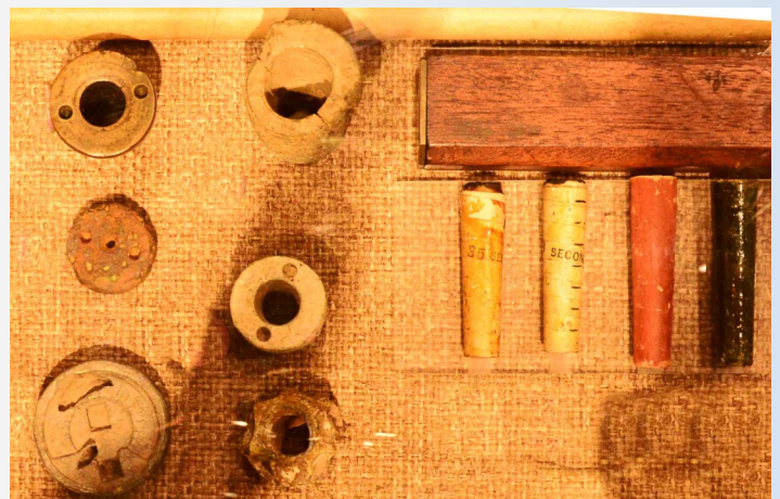
Fuses low South Mountain