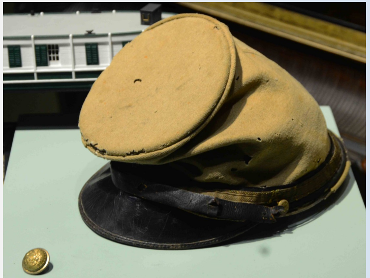
Jacksons cap from VMI