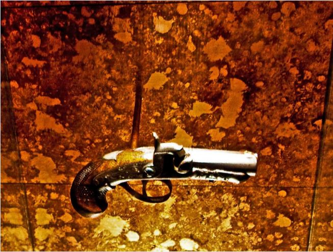
Booth pistol Ford's Theater