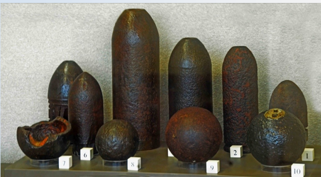
Artillery shells Manassas