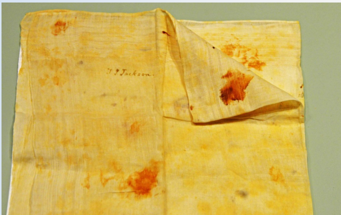
Jacksons handkerchief with his blood on it