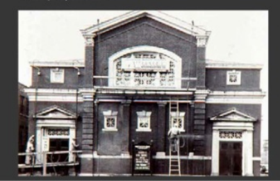
2018 | Western Specialty Contractors