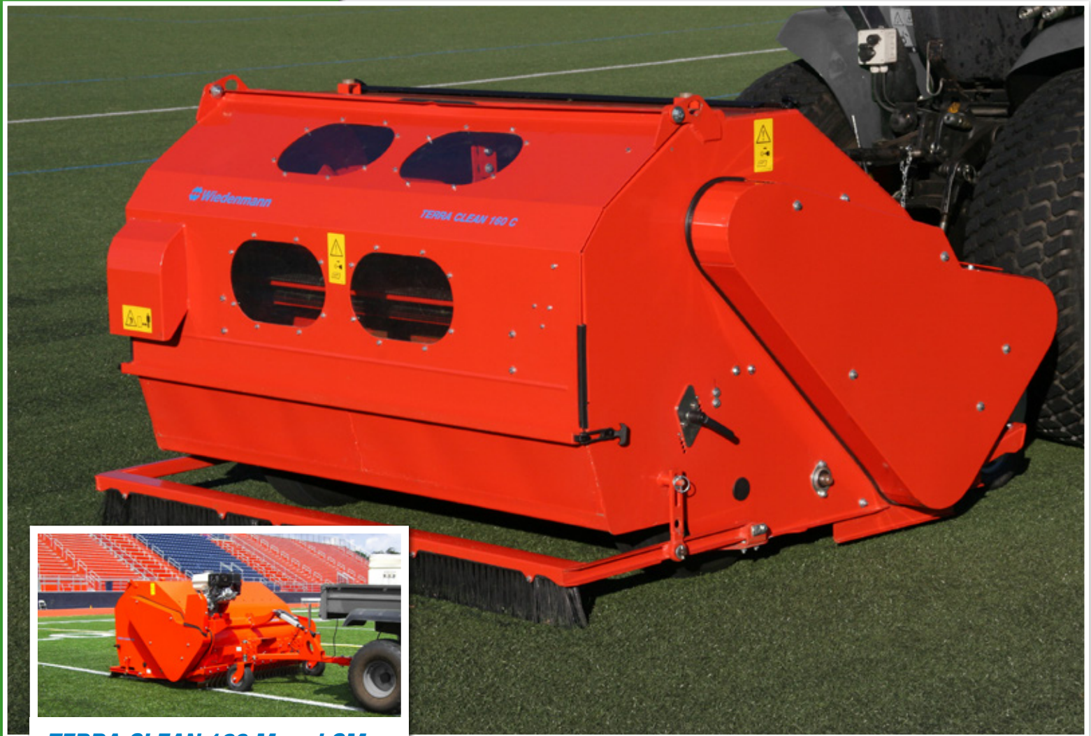
TERRA CLEAN 160 M and CM

For intensive cleaning and dust removal of filled artificial turf surfaces.