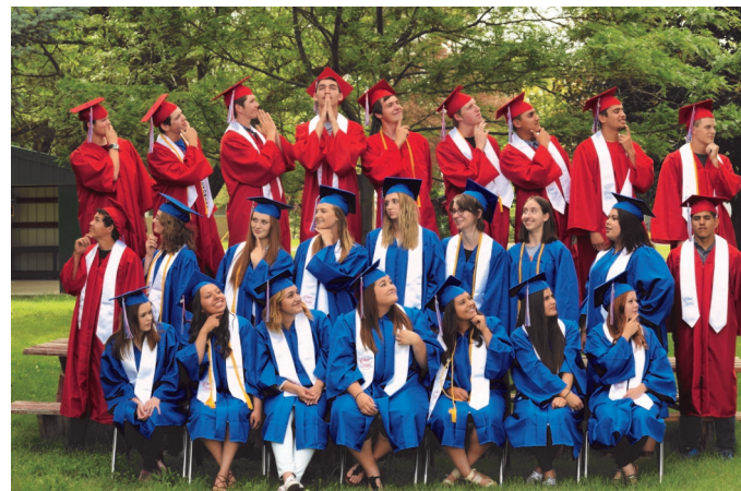
Class of 2016 ... contemplating their futures!