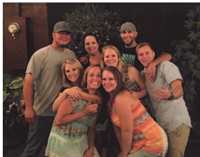
Class of 2006 10 year reunion fun