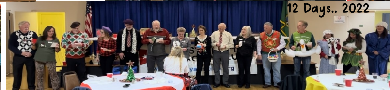
12 Days.. 2022