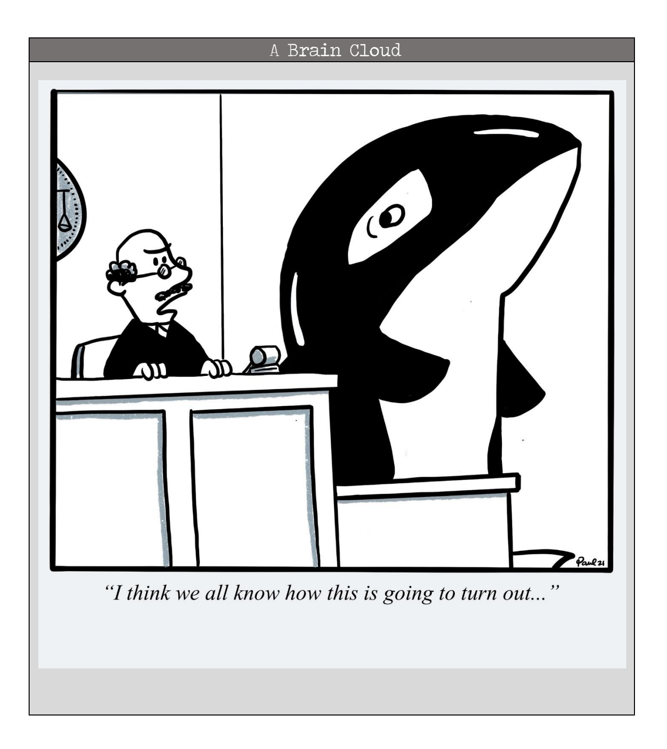
As always, thank you for reading. Love and peace to you all.