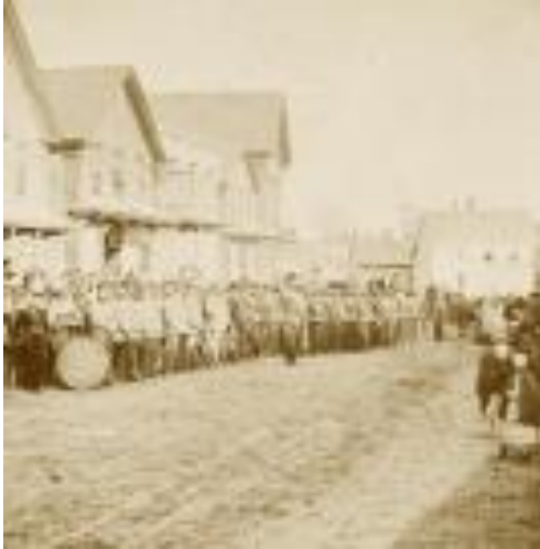
One of the intents of the proposed zoning is keeping downtown to this awesome scale