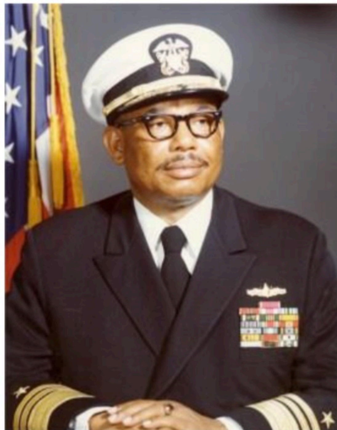
Naval Historical Foundation

Vice Admiral Gravelly was born and raised in Richmond, VA in 1922. He joined the Navy in 1942 and rose from the rank of Seaman to Vice Admiral. In addition to being the first African American Admiral, he is also the first African American to command a US Navy warship ( CHANDLER DD-717 ), the first African American to command an American warship under combat conditions ( TAUSSIG DD-746 ), the first African American to command a major naval warship ( JOUETT CG-29 ), the first African American to rise to the rank of Vice Admiral, and the first African American to command a U.S. Navy Fleet. He retired from the Navy in 1980, died at age 82 in 2004 and is buried at the Arlington National Cemetery. The Navy honored Admiral Gravelly in 2010 with the commissioning of the destroyer USS GRAVELLY (DDG-107) , named in his honor.