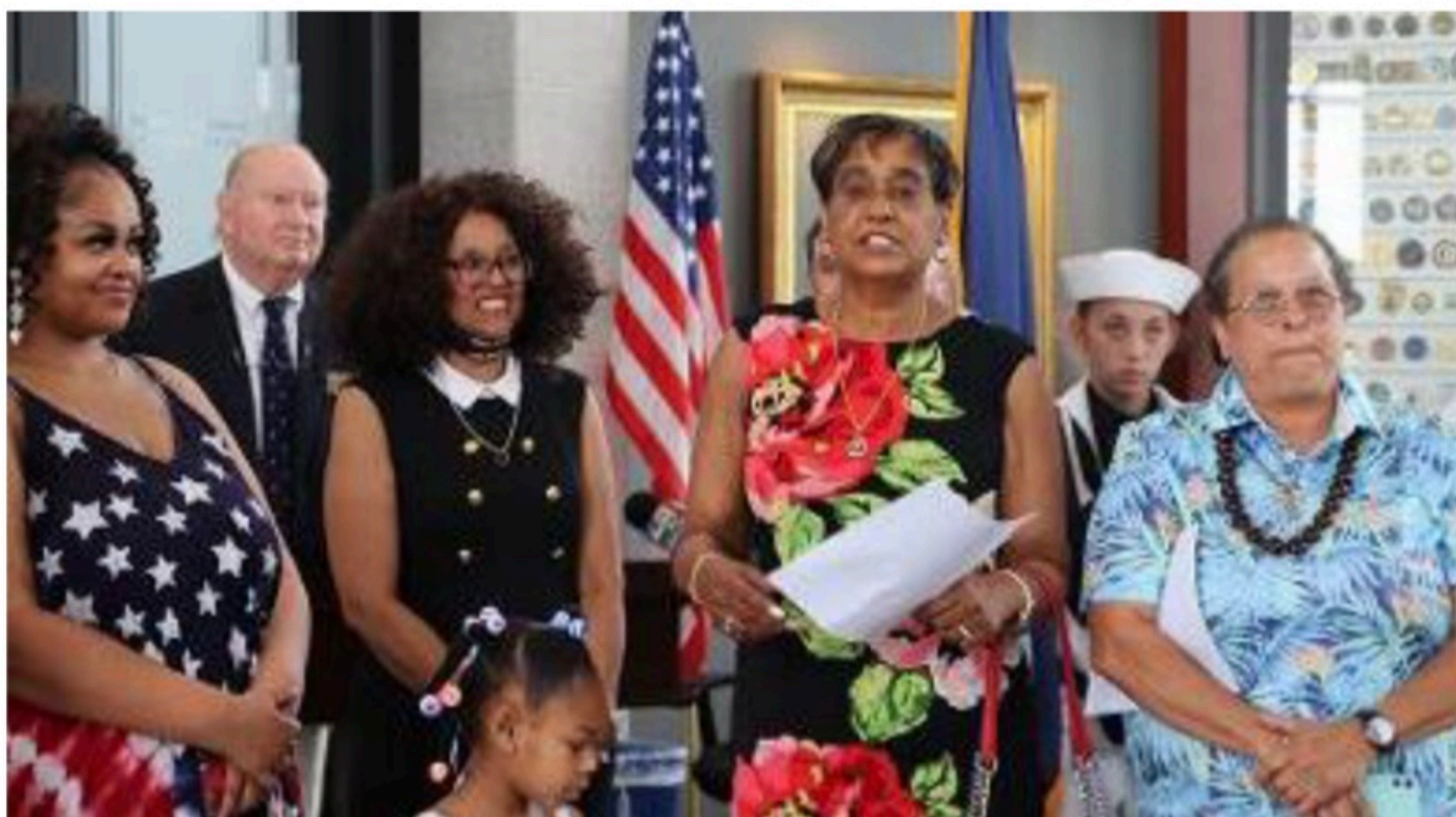
Three generations of the Gravelly Family were in attendance.