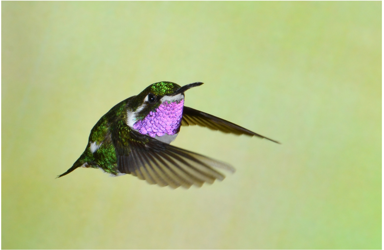
White-bellied Woodstar [Guango Lodge]