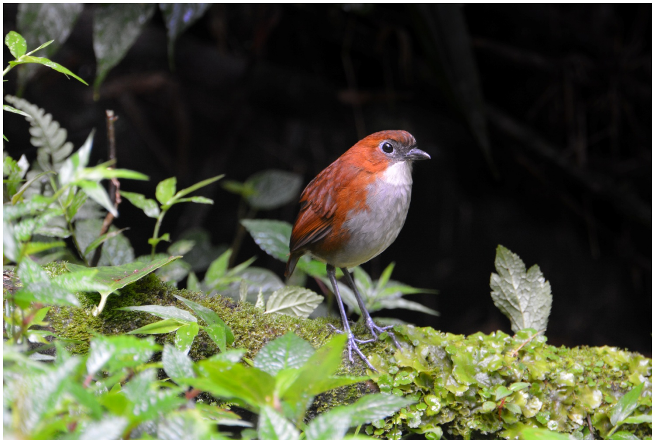
White-bellied Antpitta [San Isidro Lodge]