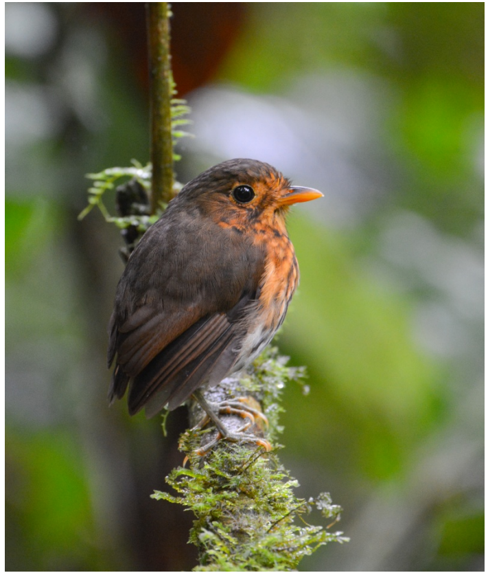
Rufous-crowned Tody-Flycatcher [San Isidro Lodge]; Ochre-breasted Antpitta [Antpitta Trail at Wild Sumaco Lodge]