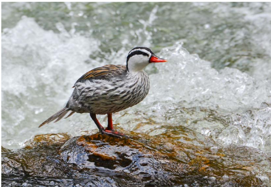
Torrent Duck [Río Papallacta near to Guango Lodge]