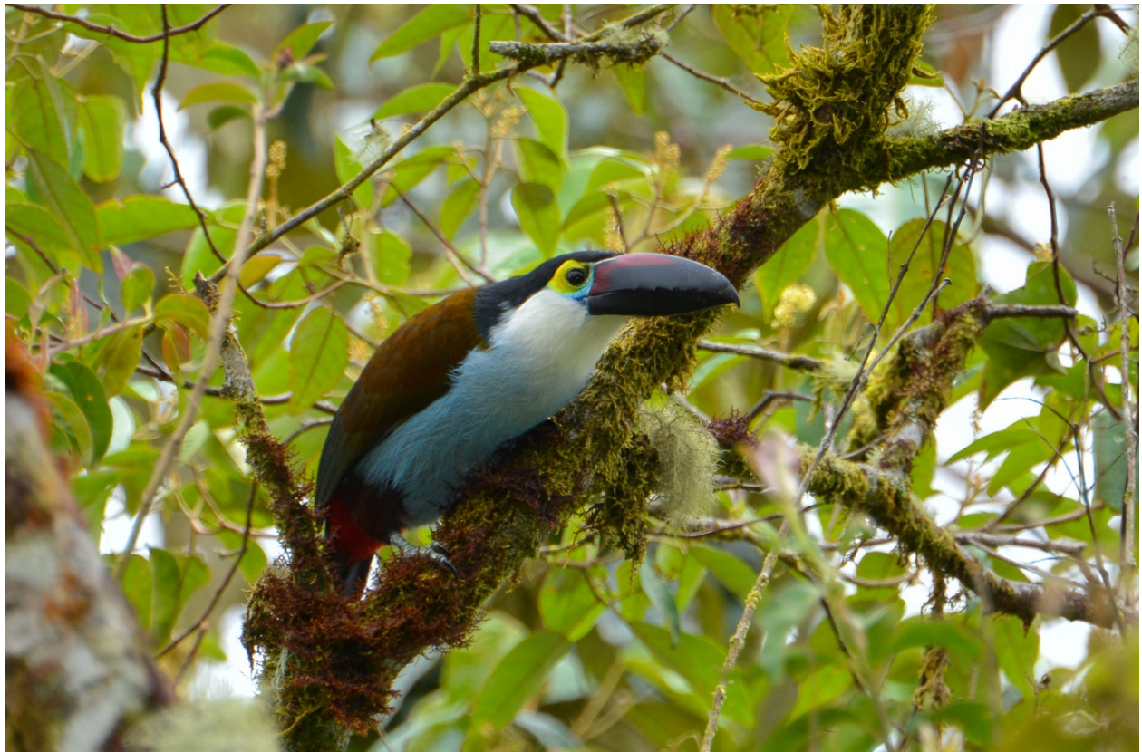
Black-billed Mountain-Toucan [Guacamayo Ridge]