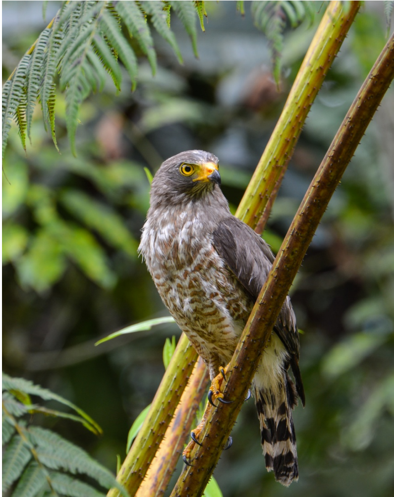
Roadside Hawk [Loreto Road]