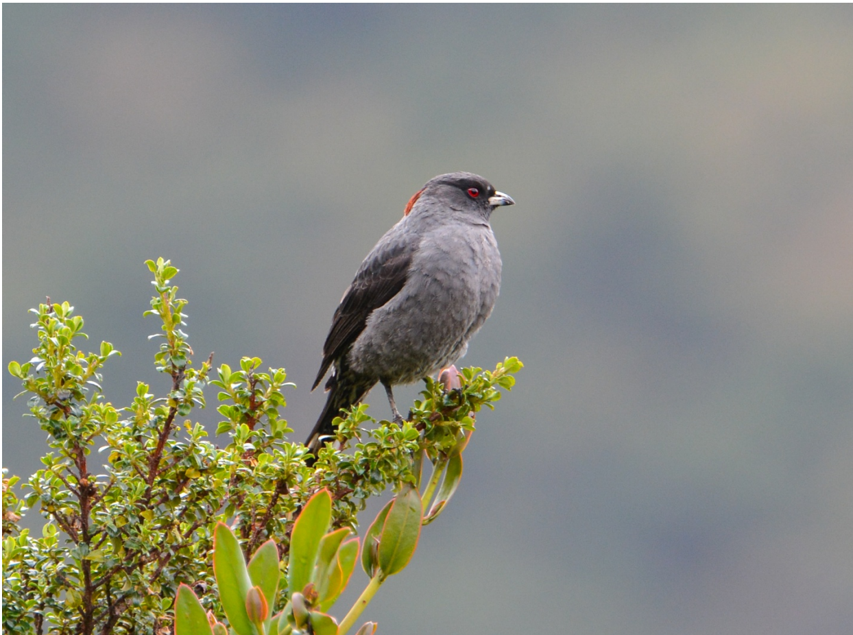
Red-crested Cotinga [Reserva Ecológica Cayambe-Coca near Papallacta]