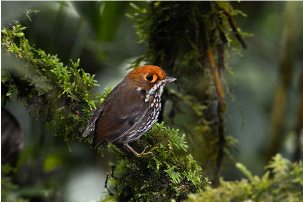
Peruvian Antpitta [Jumandy Trail, Guacamayo Ridge]

Although I had birded the upper elevation areas before, the combination of Marcelo's outstanding knowledge of the bird calls and the opportunity to access some different sites in this general area helped me see a significant number of high and mid-elevation lifer species. Then, as we descended towards Wild Sumaco, an even higher proportion of the birds were new for me – not just the skulkers and rarities. The resulting trip list of 344 species (including 30 heard only) was one of the largest of any trip that I have done and included 85 lifers seen, plus 14 heard only. Despite the large number of species present in Ecuador, the habitat continuity with neighbouring countries means that very few of these are Ecuadorian political endemics – in fact none of the species I encountered on this trip are considered to be endemic to Ecuador.