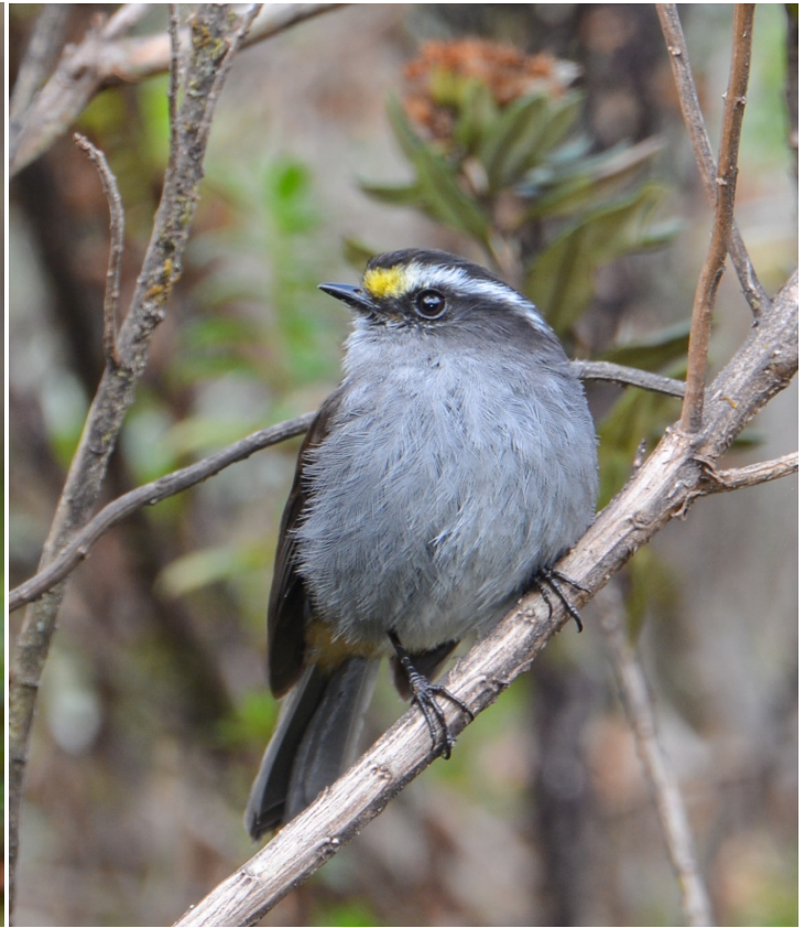
White-chinned Thistletail; Crowned Chat-Tyrant [both Reserva Ecológica Cayambe-Coca near Papallacta]