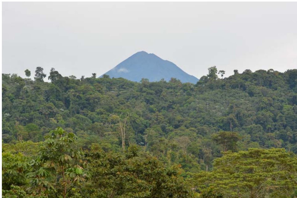
Summit of Sumaco Volcano as seen from access road to Wild Sumaco Lodge