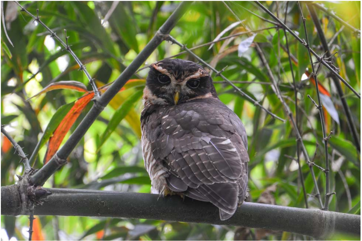
Band-bellied Owl [FACE Trail at Wild Sumaco Lodge]