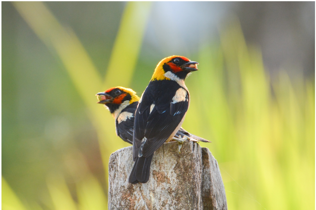
Flame-faced Tanagers [Las Caucheros road above San Isidro Lodge]