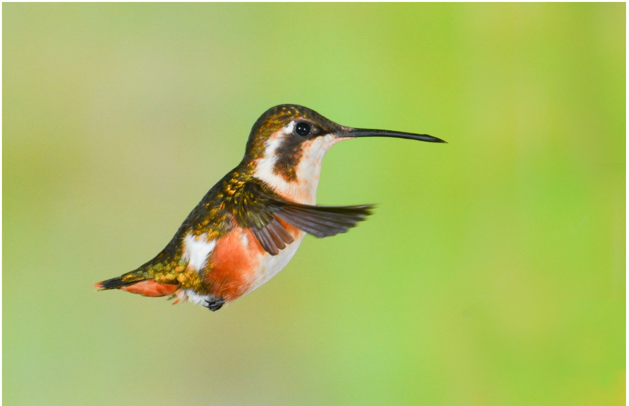
White-bellied Woodstar (f) [Guango Lodge]