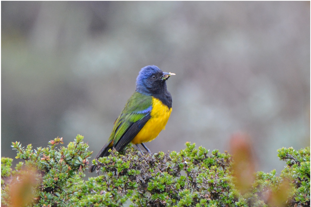
Black-chested Mountain-Tanager [Reserva Ecológica Cayambe-Coca near Papallacta]