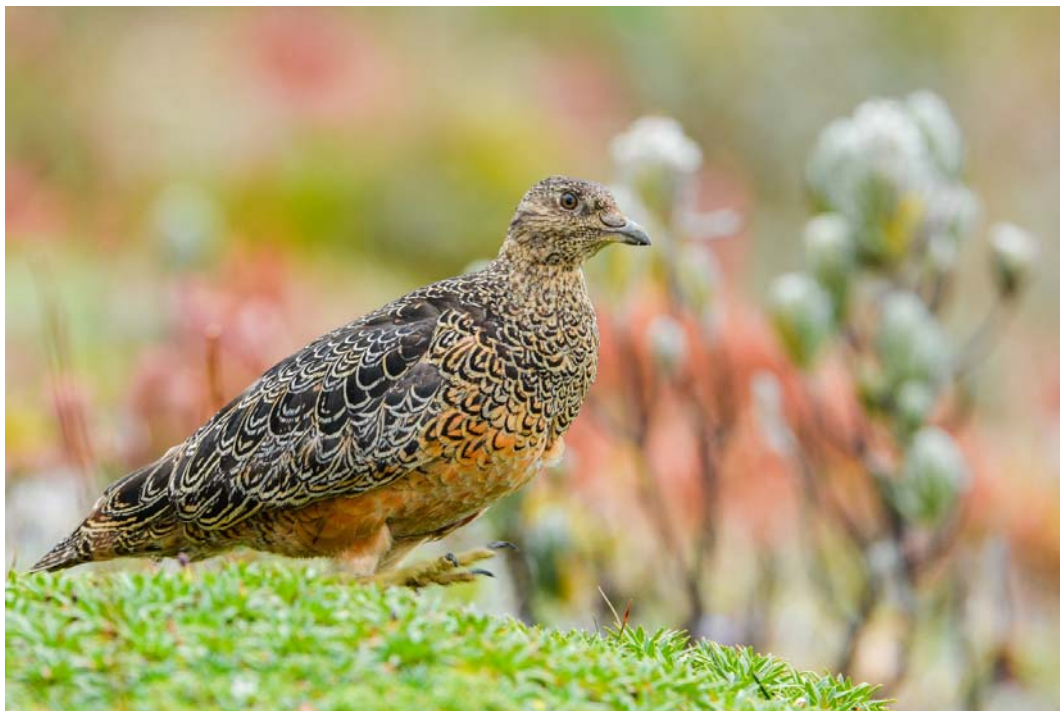
Rufous-bellied Seedsnipe [Papallacta Pass]

I never tire of seeing the immaculately presented and amazingly skilled Torrent Ducks that inhabit the Río Papallacta behind Guango Lodge and I enjoyed photographing a pair as they moved from boulder to boulder in the surging water. The lodge's feeders also presented with me with my first opportunity to briefly experiment with utilizing the multi-flash technique to photograph flying hummingbirds.