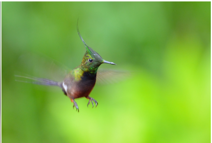
Sparking Violetear; Wire-crested Thorntail [Balcony at Wild Sumaco Lodge]