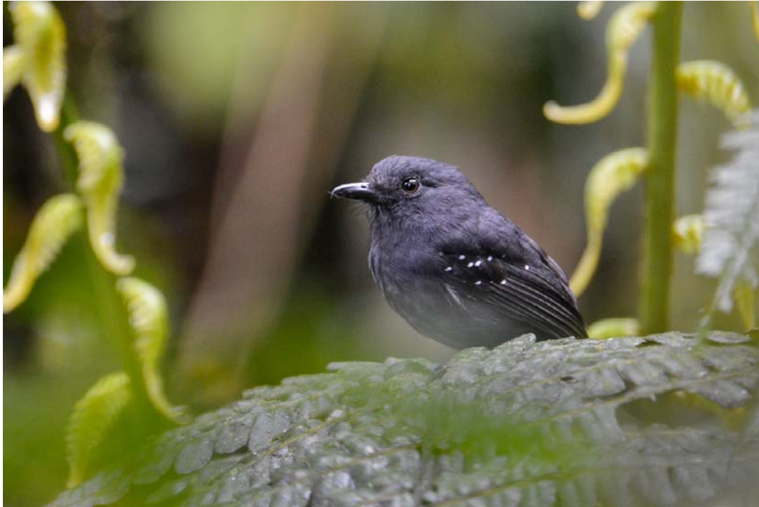
Bicolored Antvireo [San Isidro Lodge]

San Isidro highlights included a Wattled Guan seen at dusk as it called from the top of a distant tree, a confiding pair of Bicolored Antvireos that appeared on cue alongside a creek, and a Barred Antthrush that simultaneously thrilled me as a birder (by providing stunning views as it approached through the cluttered undergrowth to within mere feet) and tortured me as a photographer (by never providing the opportunity for the aspired clear shot)!