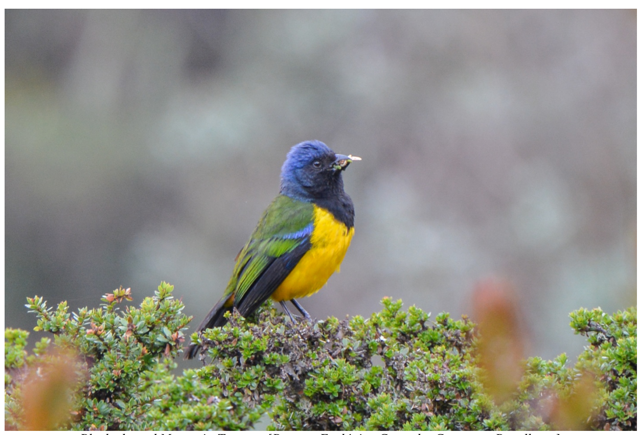
Black-chested Mountain-Tanager [Reserva Ecológica Cayambe-Coca near Papallacta]