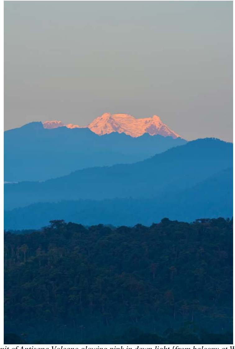
Snow-covered summit of Antisana Volcano glowing pink in dawn light [from balcony at Wild Sumaco Lodge]