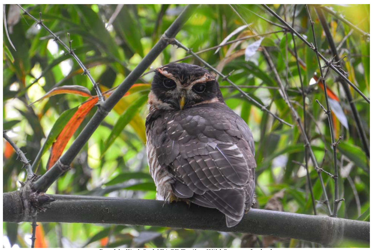
Band-bellied Owl [FACE Trail at Wild Sumaco Lodge]