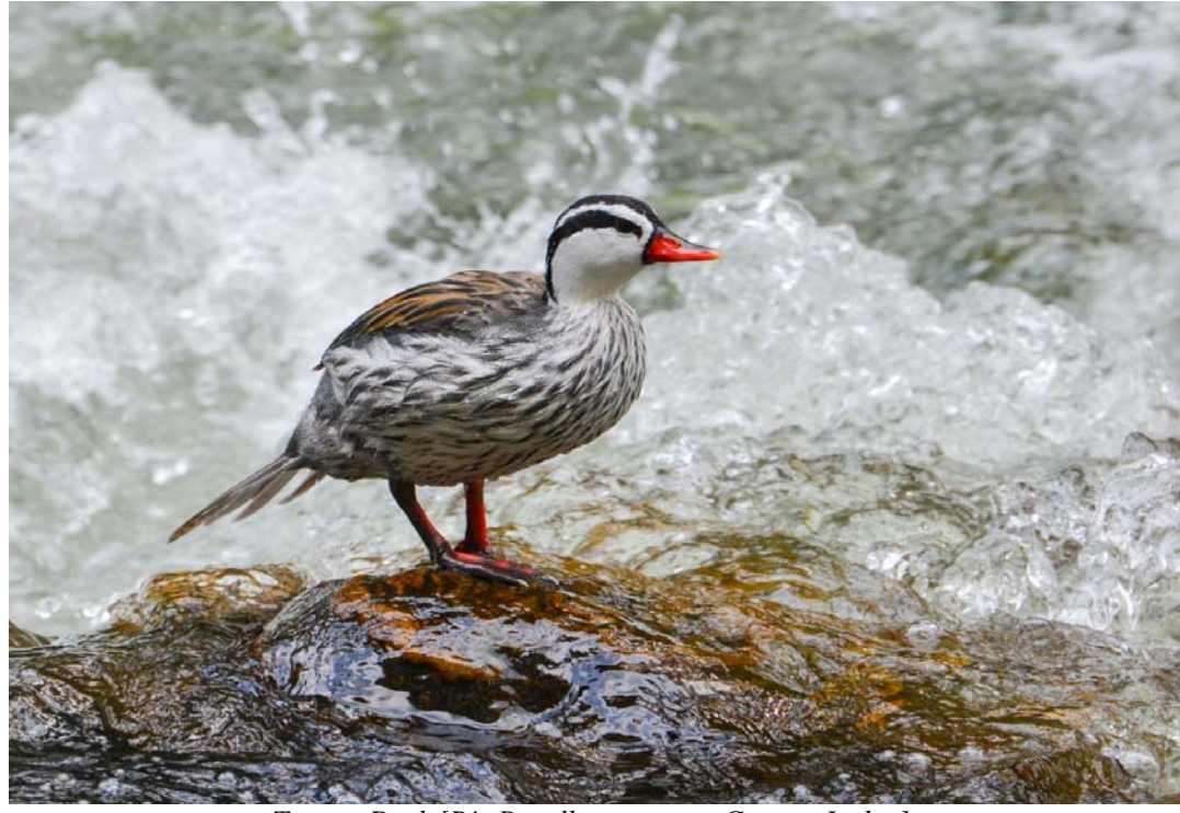
Torrent Duck [Río Papallacta near to Guango Lodge]