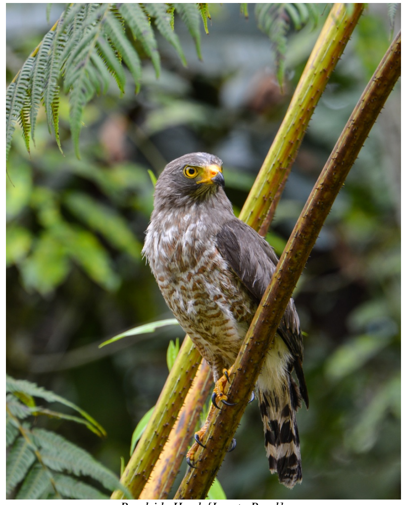
Roadside Hawk [Loreto Road]