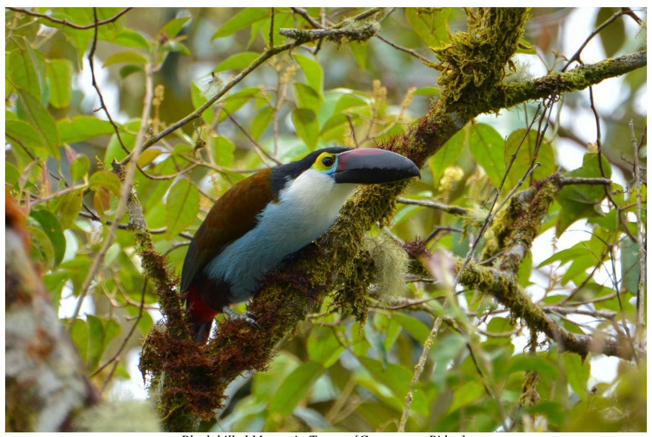
Black-billed Mountain-Toucan [Guacamayo Ridge]