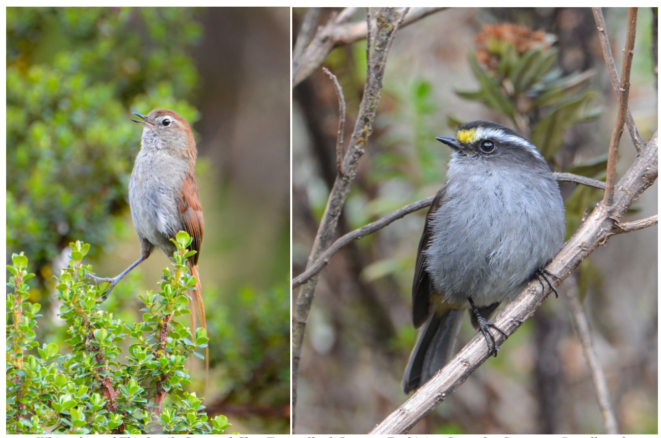
White-chinned Thistletail; Crowned Chat-Tyrant [both Reserva Ecológica Cayambe-Coca near Papallacta]