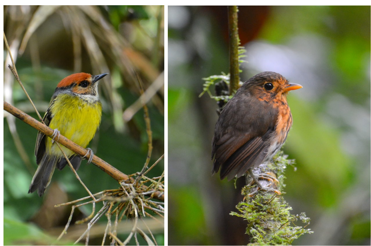
Rufous-crowned Tody-Flycatcher [San Isidro Lodge]; Ochre-breasted Antpitta [Antpitta Trail at Wild Sumaco Lodge]