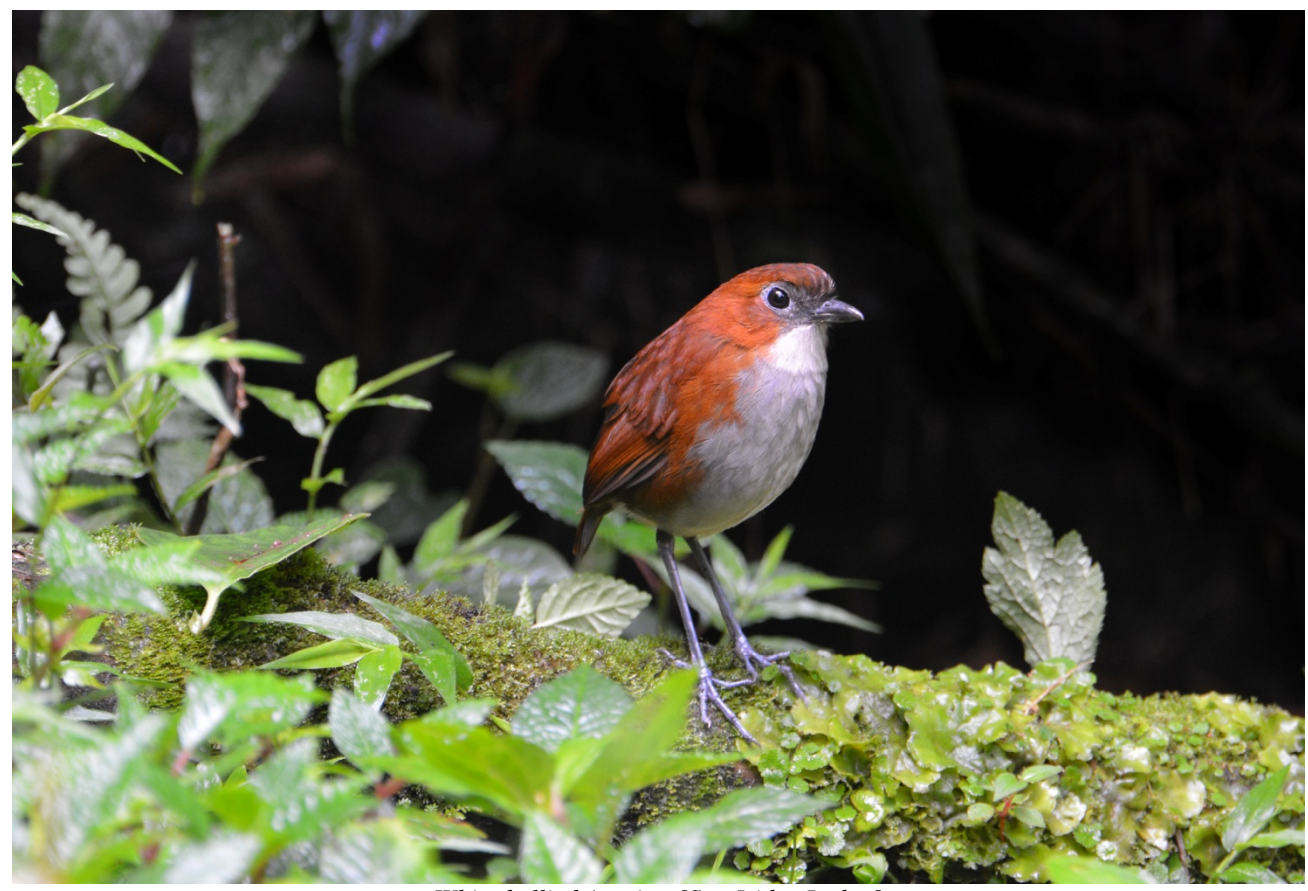
White-bellied Antpitta [San Isidro Lodge]