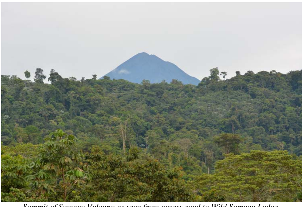
Summit of Sumaco Volcano as seen from access road to Wild Sumaco Lodge