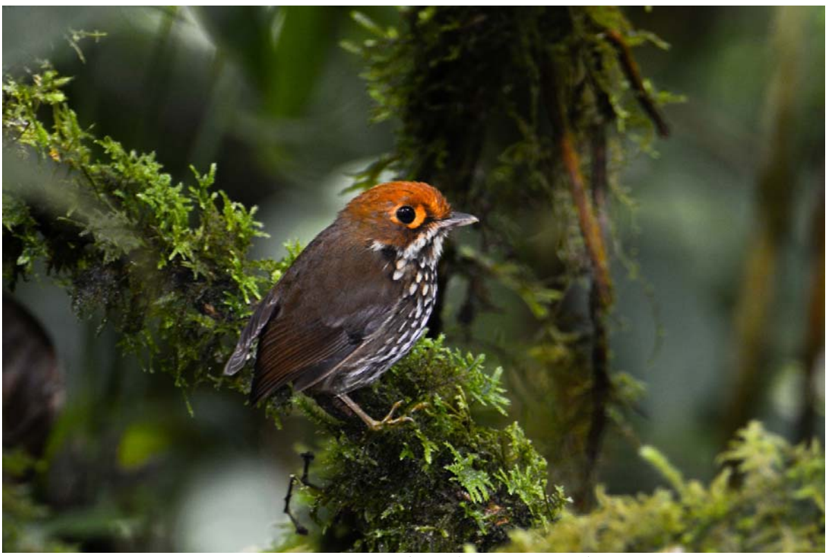
Peruvian Antpitta [Jumandy Trail, Guacamayo Ridge]

Although I had birded the upper elevation areas before, the combination of Marcelo's outstanding knowledge of the bird calls and the opportunity to access some different sites in this general area helped me see a significant number of high and mid-elevation lifer species. Then, as we descended towards Wild Sumaco, an even higher proportion of the birds were new for me – not just the skulkers and rarities. The resulting trip list of 344 species (including 30 heard only) was one of the largest of any trip that I have done and included 85 lifers seen, plus 14 heard only. Despite the large number of species present in Ecuador, the habitat continuity with neighbouring countries means that very few of these are Ecuadorian political endemics – in fact none of the species I encountered on this trip are considered to be endemic to Ecuador.