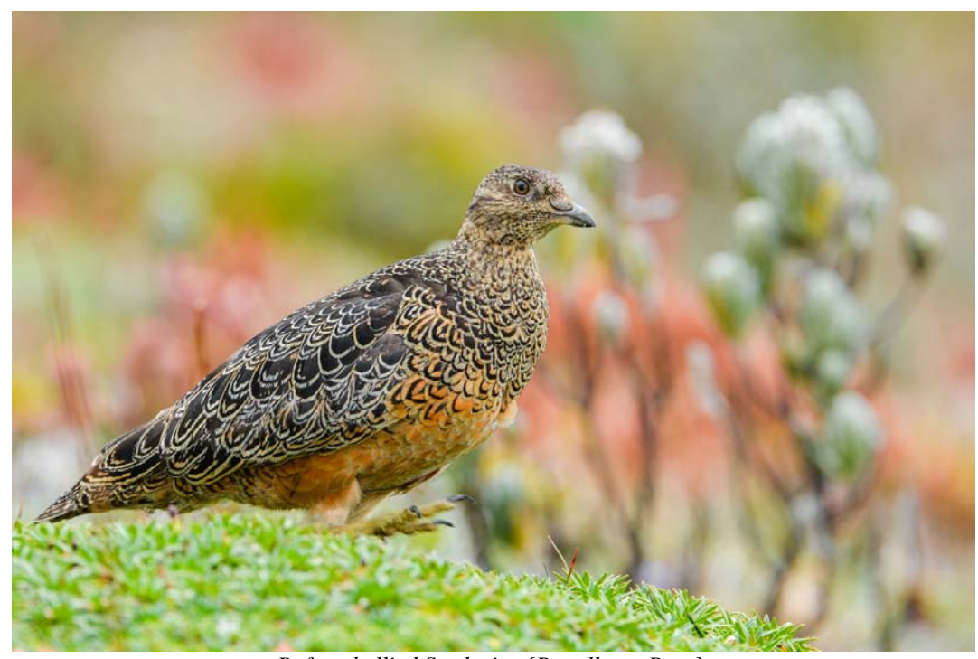
Rufous-bellied Seedsnipe [Papallacta Pass]

I never tire of seeing the immaculately presented and amazingly skilled Torrent Ducks that inhabit the Río Papallacta behind Guango Lodge and I enjoyed photographing a pair as they moved from boulder to boulder in the surging water. The lodge's feeders also presented with me with my first opportunity to briefly experiment with utilizing the multi-flash technique to photograph flying hummingbirds.