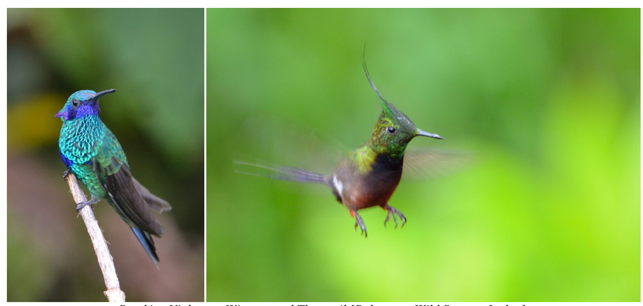
Sparking Violetear; Wire-crested Thorntail [Balcony at Wild Sumaco Lodge]