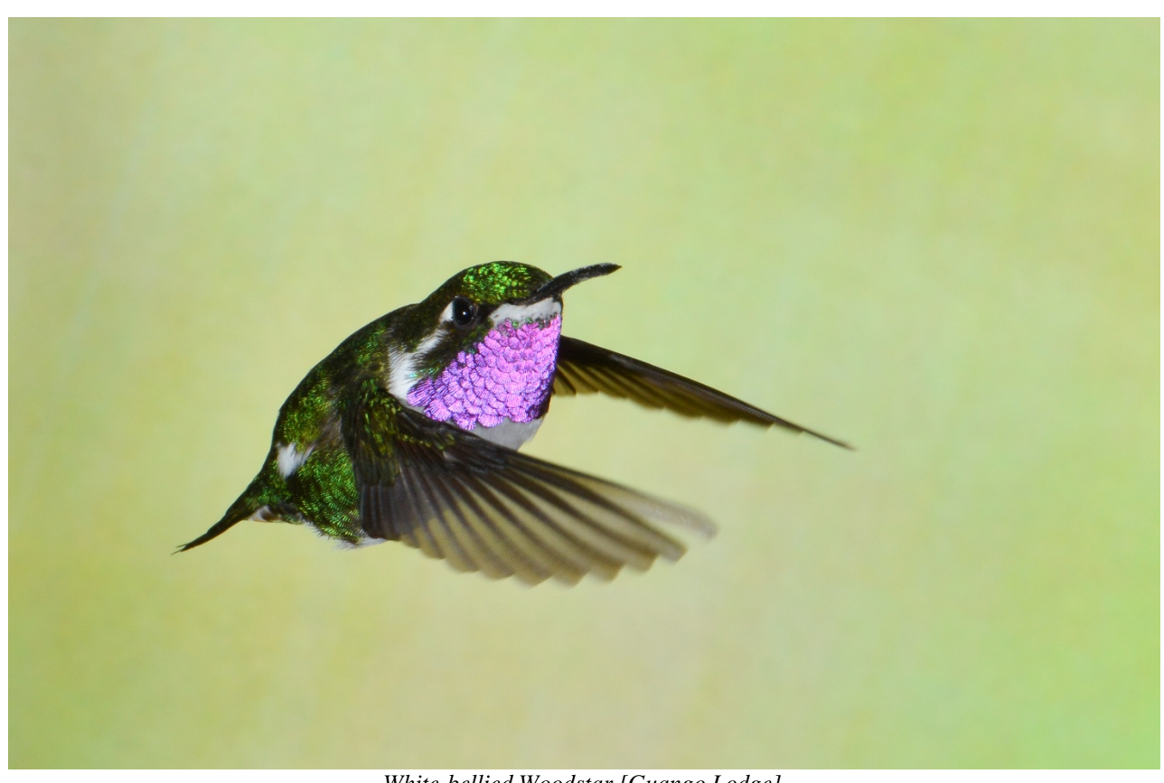
White-bellied Woodstar [Guango Lodge]