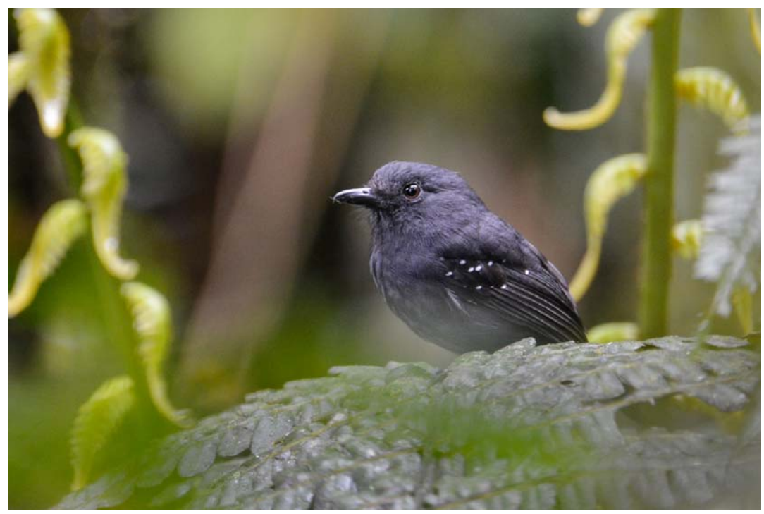
Bicolored Antvireo [San Isidro Lodge]

San Isidro highlights included a Wattled Guan seen at dusk as it called from the top of a distant tree, a confiding pair of Bicolored Antvireos that appeared on cue alongside a creek, and a Barred Antthrush that simultaneously thrilled me as a birder (by providing stunning views as it approached through the cluttered undergrowth to within mere feet) and tortured me as a photographer (by never providing the opportunity for the aspired clear shot)!