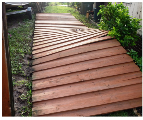
Wood fences took a beating. Note: The City has suspended the requirement for permits for fence repairs for 90 days after the storm