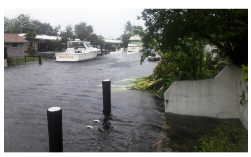
Combined with high tides, all the rain caused extremely high water levels in the canals.