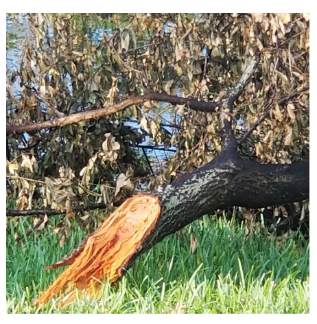
Key Largo Lane