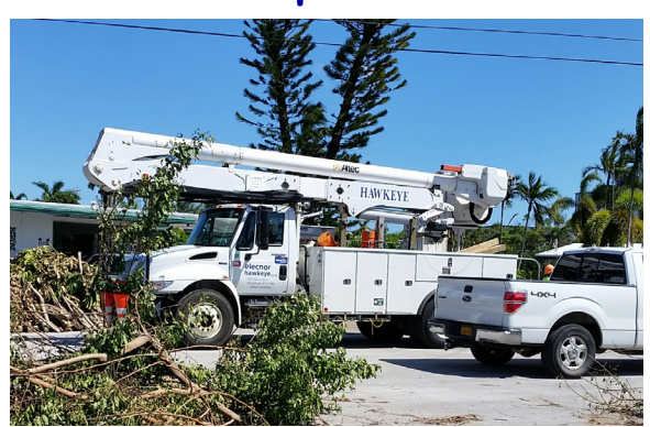
A familiar sight everywhere - power company contractors