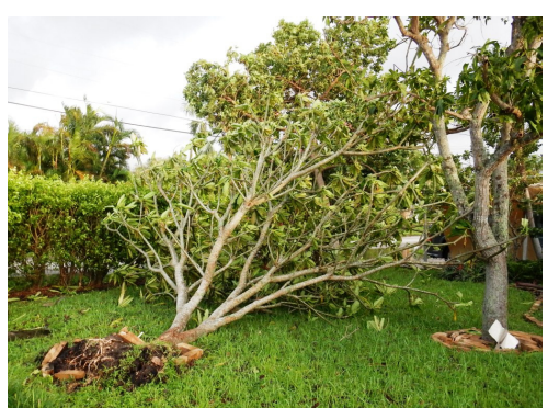
Anyone lose a tree or two?