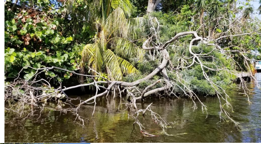
Key Largo Lane on the River

According to the City, removal of a fallen tree in the water is the responsibility of the homeowner .