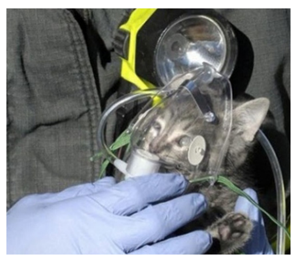
Thankfully, this little guy survived the storm on Bimini Lane

My neighbors heroically saved the food in my refrigerator! What a nice surprise to come home to! When power went out, I texted them to take any food from fridge and freezer, especially ice cream, and eat it. They didn't save the ice cream but took all the drawers out and put them in their extra fridge on generator and surprised us saving 90 percent of everything in there. Maybe they fed the ice cream to that cat that was saved.