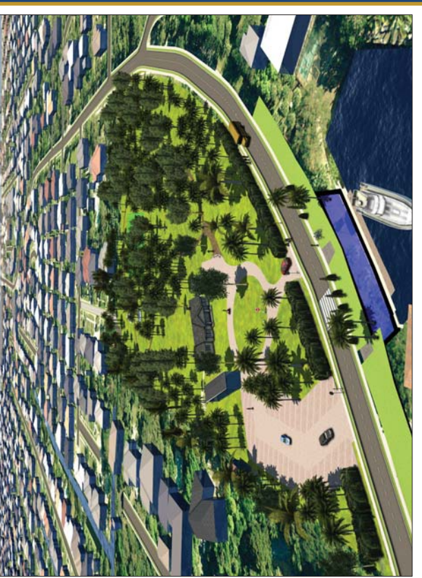
Black Property Concept