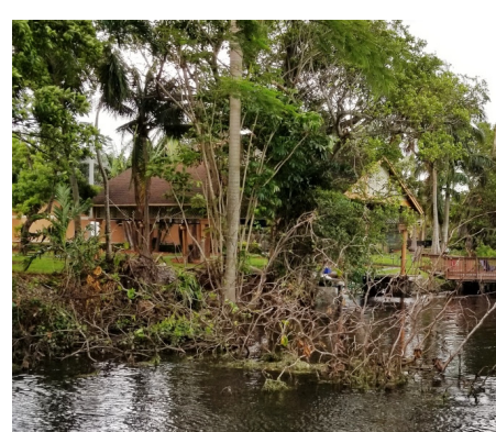
Tree on south side of the river hinders navigation. (This is a Town of Davie issue.)