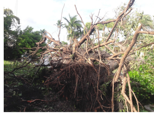
Key Largo Lane, Angelina Pluzhynk: "We lost this great old avocado tree. Luckily, we picked up all the avocados and made 6 gallons of guacamole."