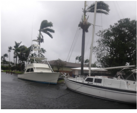
Some boaters ran lines across the canals to ride out the storm.