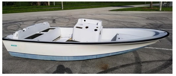
October 22 : Someone left this Boston Whaler Rage in the middle of the parking lot with a sign, "Free Boat." The FLPD Marine Unit was notified. It was gone the next day.