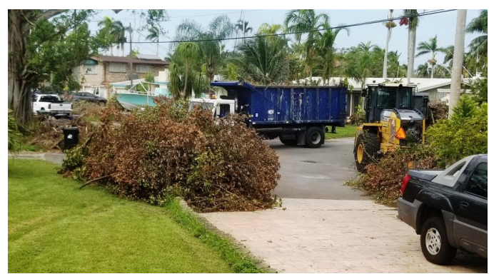
City crews on the job. Luckily our neighborhood was one of the first to be cleared.