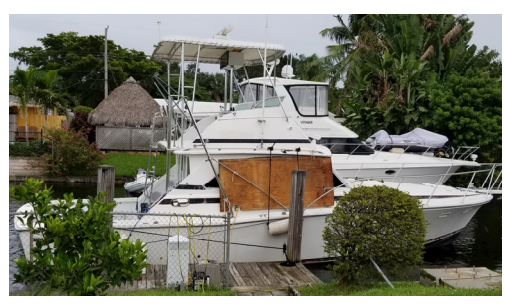
Ingenious design: Plywood hurricane shutters for boats