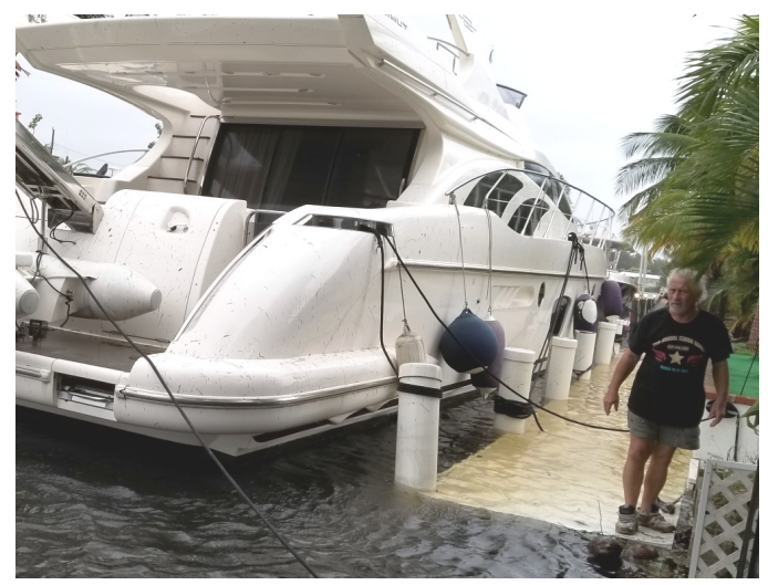
Dolphin Canal - Ken Stauch risks life and limb to add more lines to a neighbor's large yacht. Note how the first piling is leaning, as it had been pulled over by the yacht during the storm.

Whale Harbor Lane sustained damage to a utility pole, and the entire Lane was without power for about a week. Our piles of debris were removed on 9/25 which was pretty impressive. We replanted a neighbor's large gumbo limbo tree that was blown over by the storm.