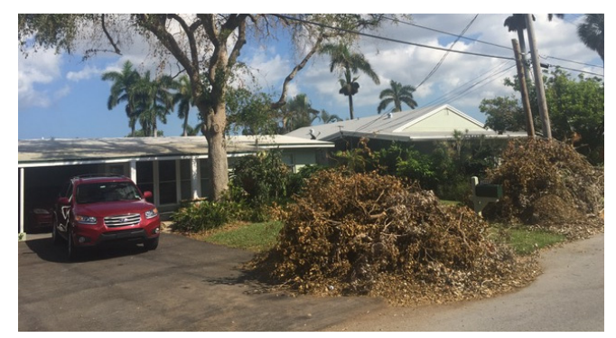
Hundreds of brush piles