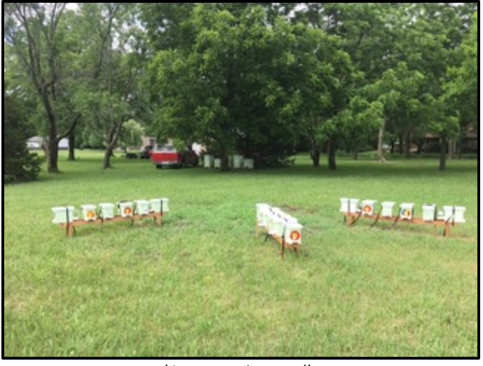
(A nuc mating yard)

I remember going to the state beekeepers meeting and there were field and commercial beekeepers. With my 150 hives, they considered me a hobbyist. After a few years, life, work, and family kind of took over and something had to give. Unfortunately, for me, it was time to give up my bees. (I voted to sell the kids, but for some reason, my wife objected.)