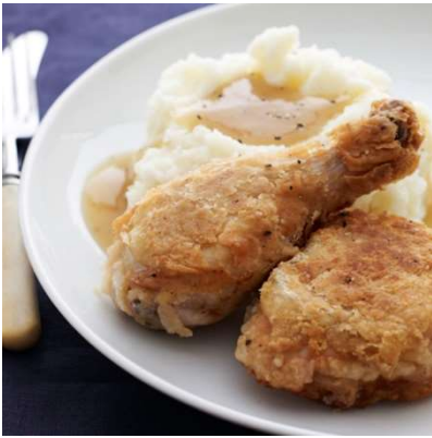
Buttermilk Fried Chicken