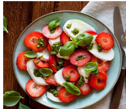
Strawberry Caprese Salad