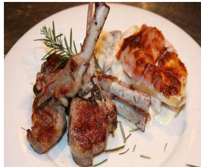
Lamb Chops, Au Gratin Potatoes