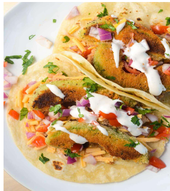
Fried Avocado Tacos