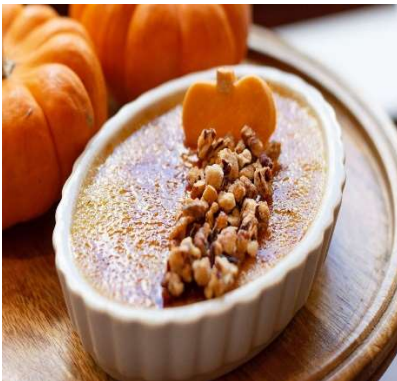
Pumpkin Crème Brulee