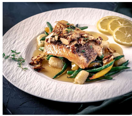
Red Snapper, Almondine