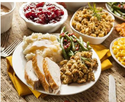
Whole Roast Turkey Dinner