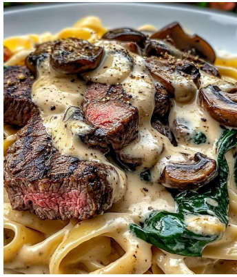
Steak Gorgonzola Alfredo