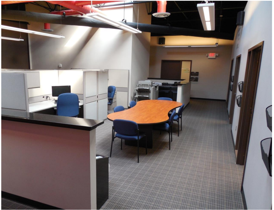
Office Floor Plan