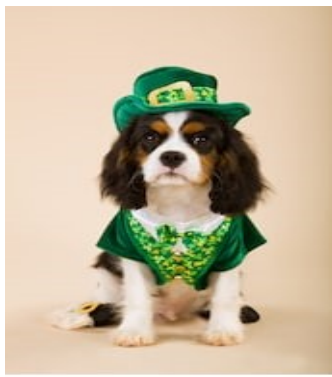
shutterstock.com • 67969816