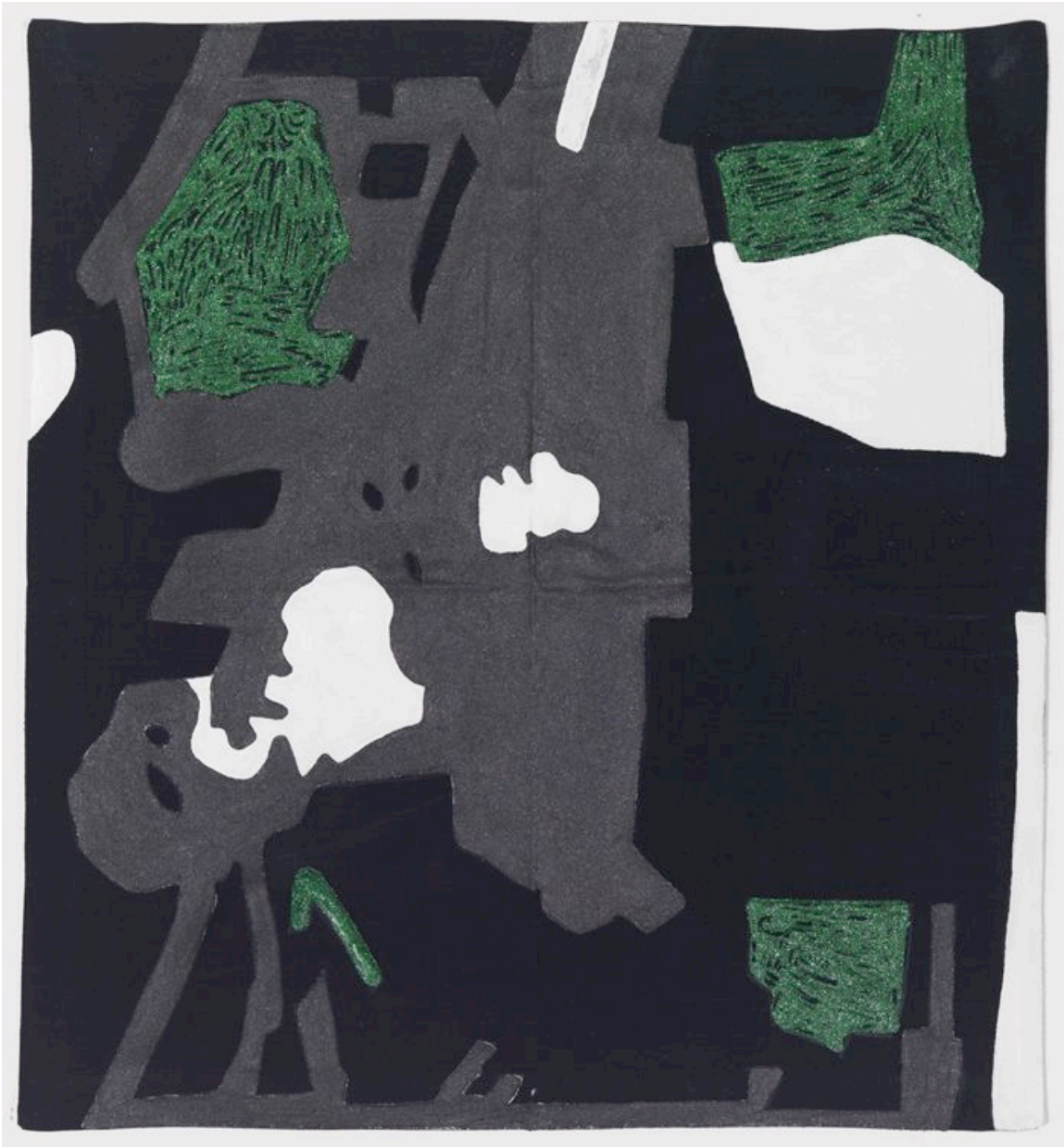
a star, 2009

500 W Cermak Rd #727, Chicago, IL 60616 • www.peregrineprogram.com • 312.752.7375 ed@peregrineprogram.com