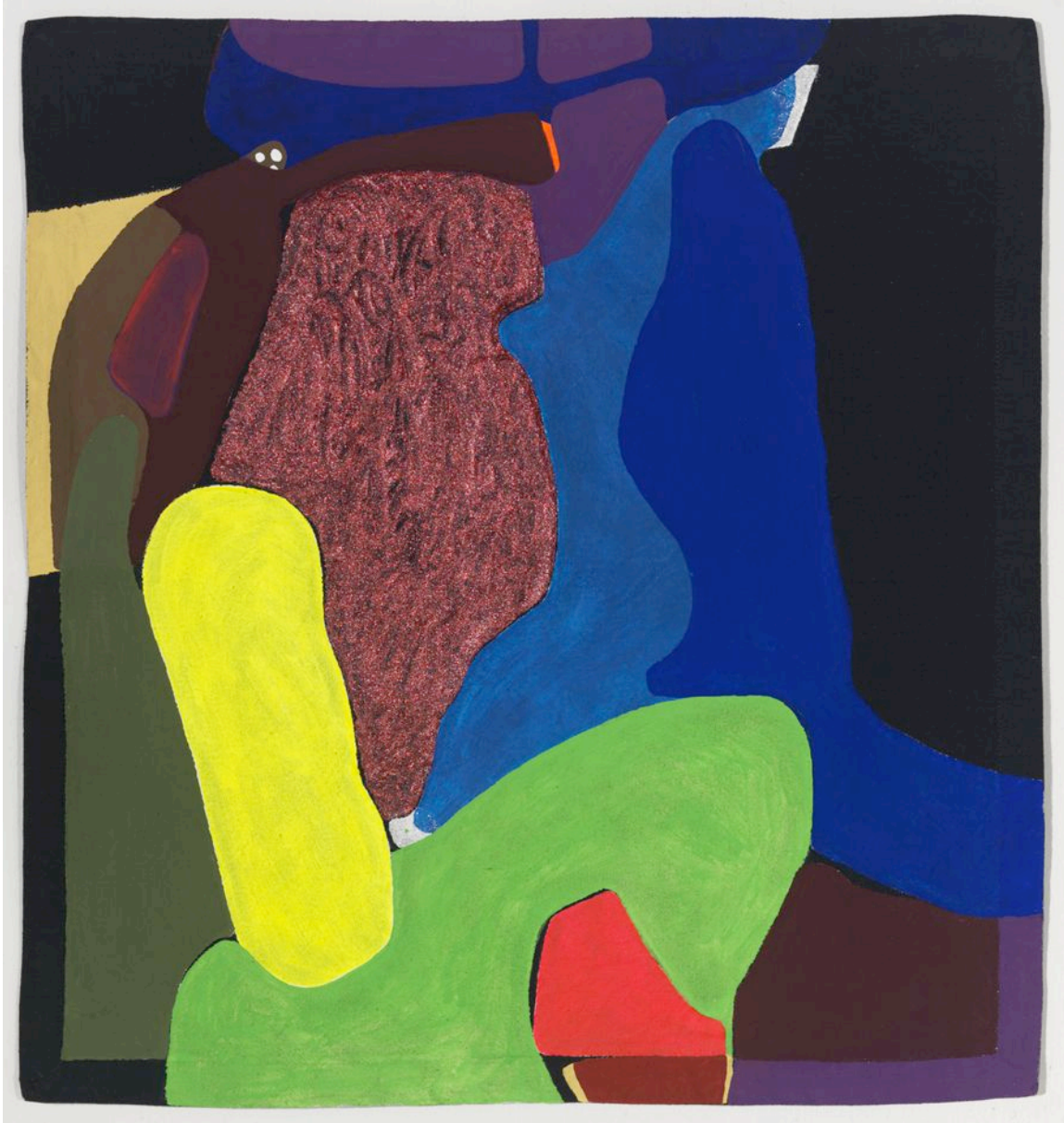
a kiss, 2009

500 W Cermak Rd #727, Chicago, IL 60616 • www.peregrineprogram.com • 312.752.7375 ed@peregrineprogram.com