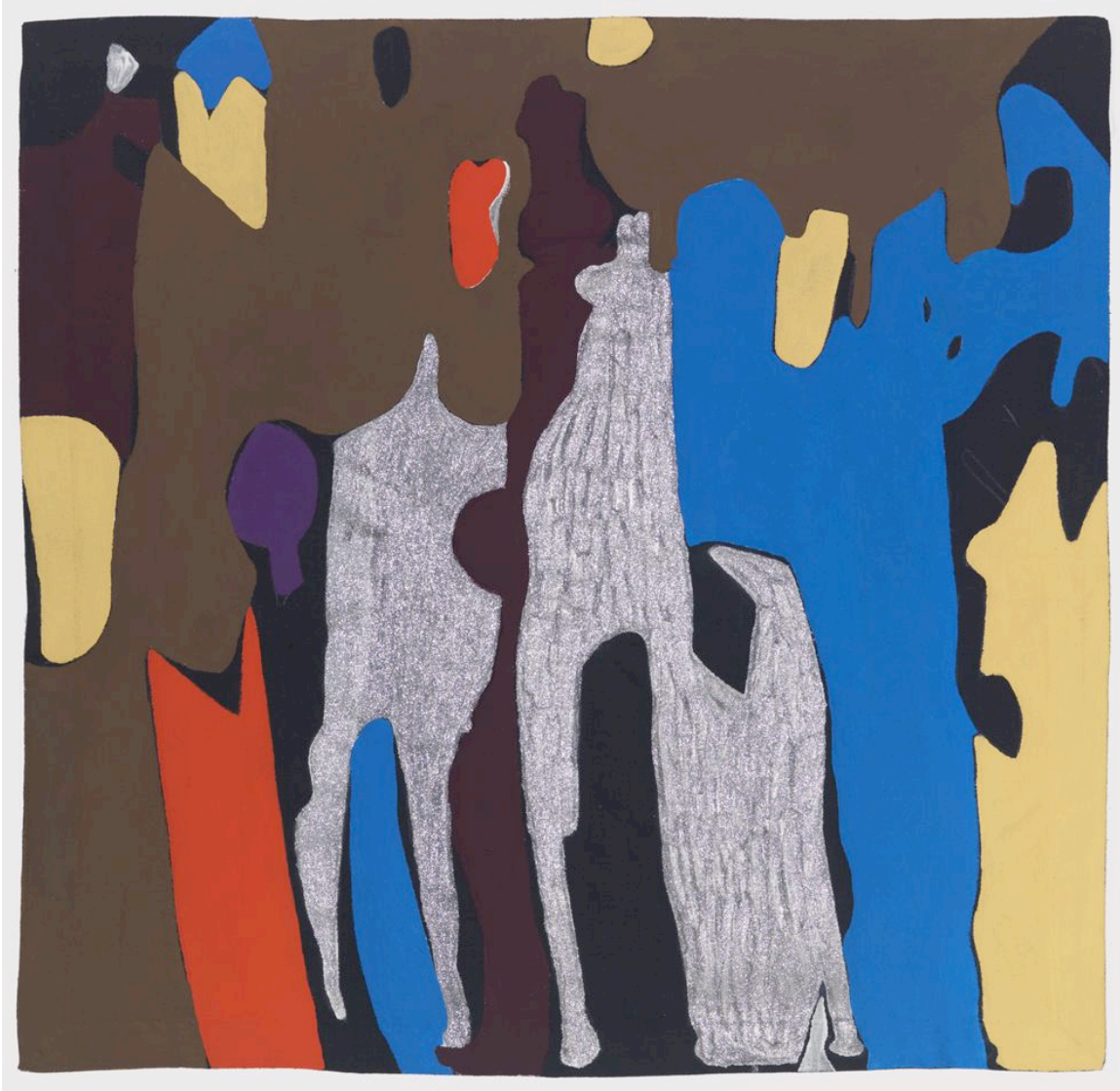
a flag, 2009

Acrylic, pencil on cotton, 19.5" x 19.5"