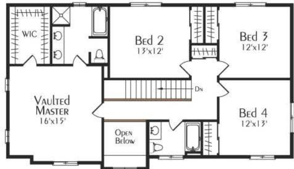
Top Floor SqFt. = 1177 8' Tall Walls

(Color combinations for brochure use only)