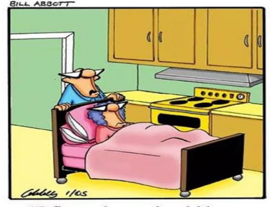
"I figured you should have breakfast in bed on your birthday. Can you reach the stove okay?"