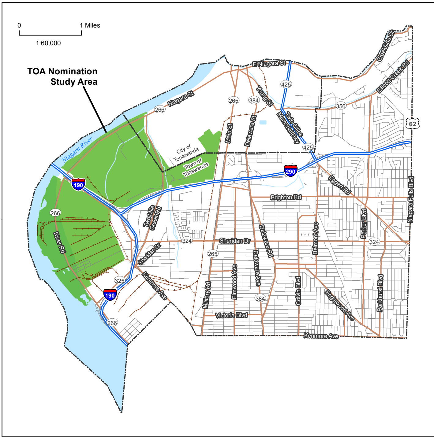
Tonawanda Opportunity Area (TOA) Nomination Study Area within the Town and City of Tonawanda