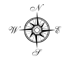
STUDY AREA CONTEXT MAP

TOWN OF TONAWANDA TONAWANDA OPPORTUNITY AREA NOMINATION STUDY