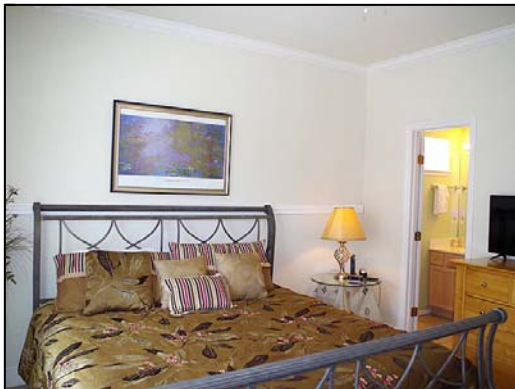
master bedroom master bedroom has attached bath