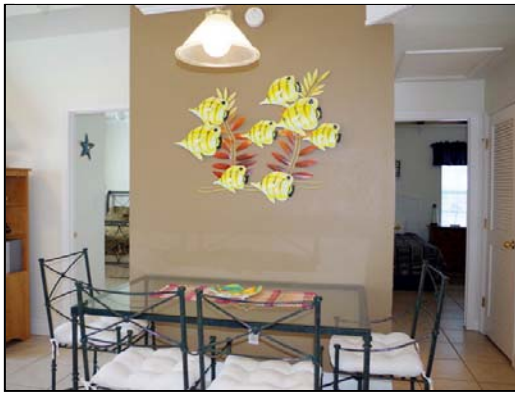
dining accent wall in dining area