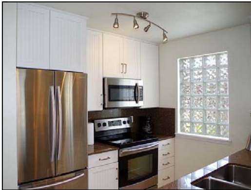
kitchen stainless steel appliances