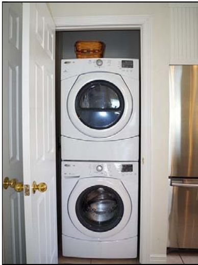
utility convenient full size washer dryer in condo