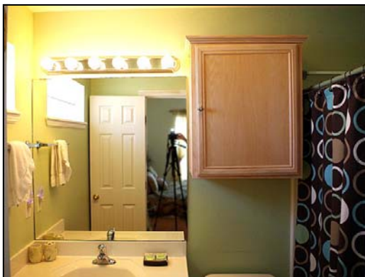
master bath master bath has tub/shower combo