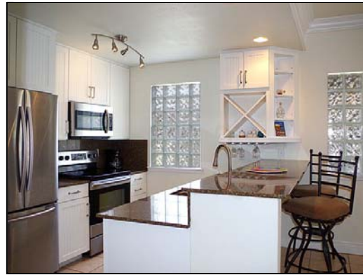
kitchen new kitchen in 2015