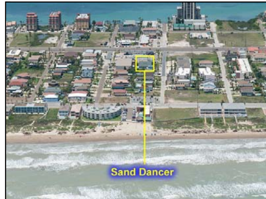
short walk to beach