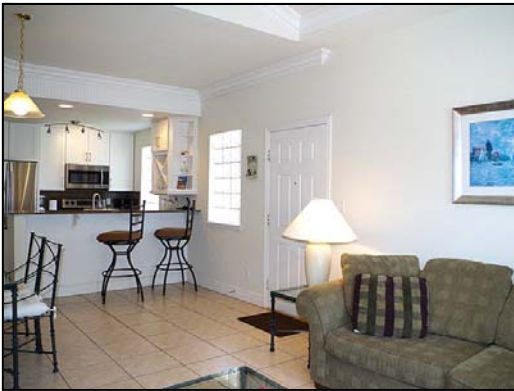
living spacious living area