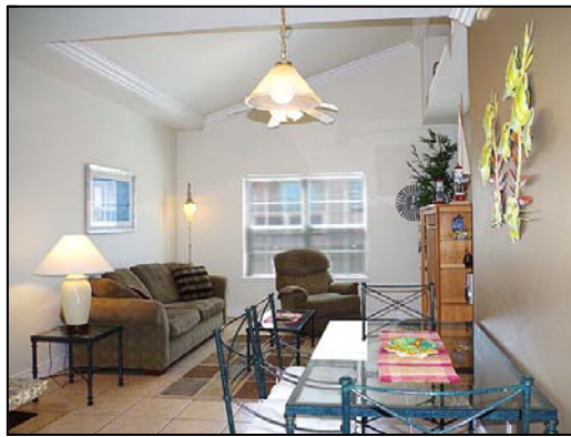
living selling fully furnished