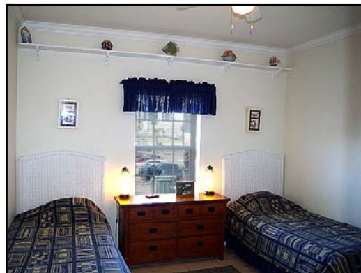
guest bedroom very large guest bedroom