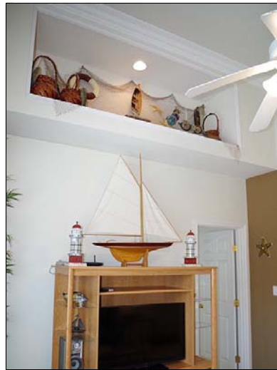
living lighted shelf