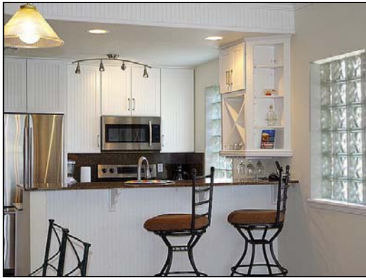
additional seating for dining