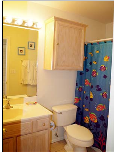
guest bath guest bath has tub/shower combo