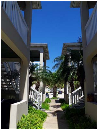
courtyard lushly landscaped courtyard