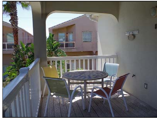
balcony spacious shaded balcony