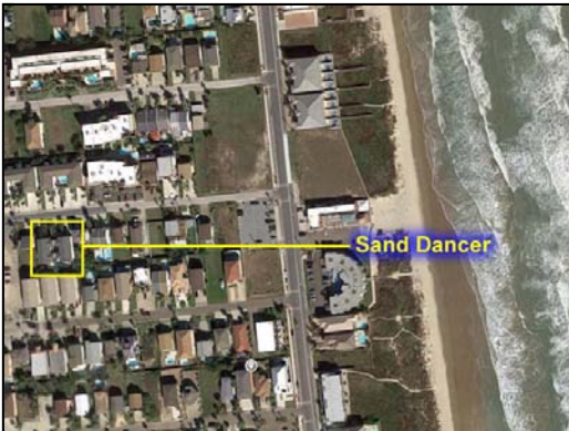
short walk to beach