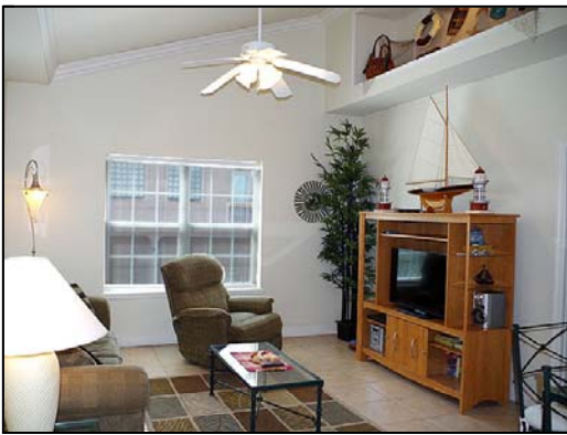
living spacious living area