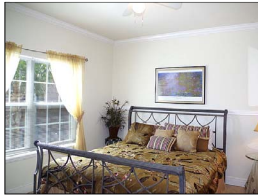
master bedroom spacious master bedroom