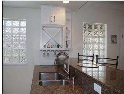
kitchen glass block and granite