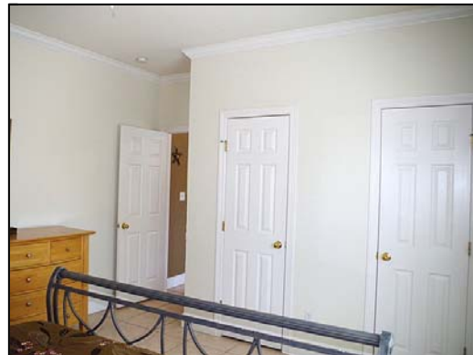
master bedroom two closets in master