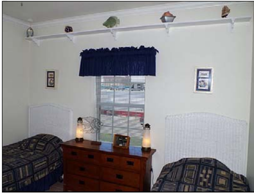
guest bedroom cute, decorative shelf in guest bedroom