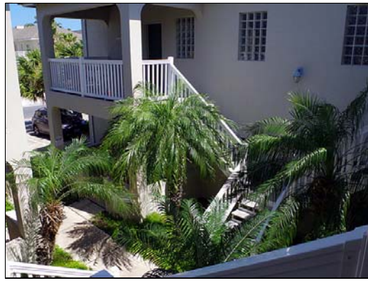
courtyard view of courtyard from balcony