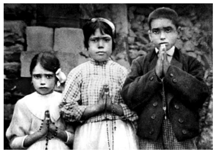
WHAT IS THE "FINAL BATTLE" THAT SISTER LUCIA OF FATIMA SPOKE OF?

Yet the disciples didn't feel the need for a mission statement or a fundraiser or a building committee or even the inkling of a doctrinal pronouncement. The one thing needful in that initial hour of being church was to devote themselves, as it says in Acts, to prayer. If you and I have never attacked prayer with single-hearted devotion, then we can't compare our experience of praying to theirs. We can't imagine that, in a book that describes the actions of apostles, how prayer can be a very active form of engagement.