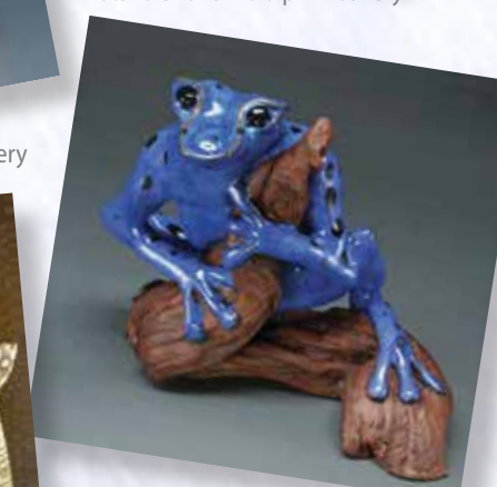
Alexis Moyer- The Pot Shop