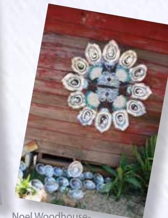
Noel Woodhouse- North Street Collective