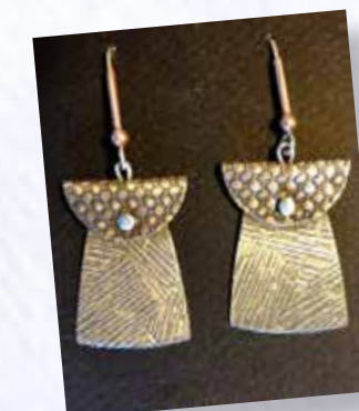
Colleen Schenck- Schneck Barn