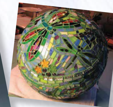
Star DeHaven- Dolphin Gallery